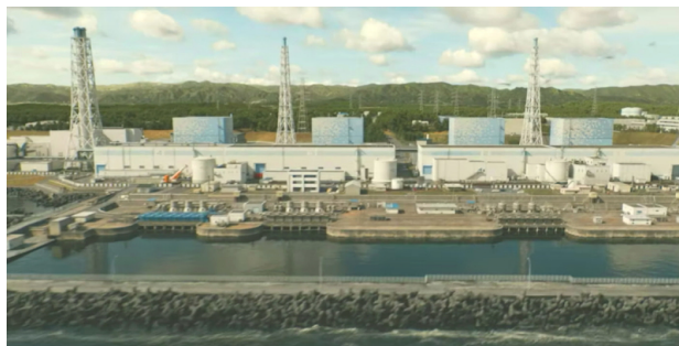
Computer generated digital effects recreate the Fukushima Daiichi nuclear

Keywords: Fukushima, meltdown, radiation, management, responsibility