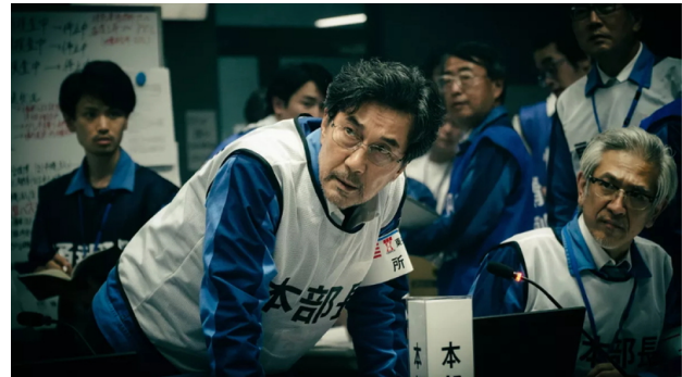
Yoshida at the center of the SIB, surrounded by mostly nameless technical and administrative staff, effectively all men, young and old (Netflix 2023).

crews were often made up of impoverished laborers who were recruited, and then underpaid, by Yakuza affiliated subcontractors; much as has always been true in the “normal” maintenance and cleaning of Japanese nuclear reactors (Nuclear Watch 2014).