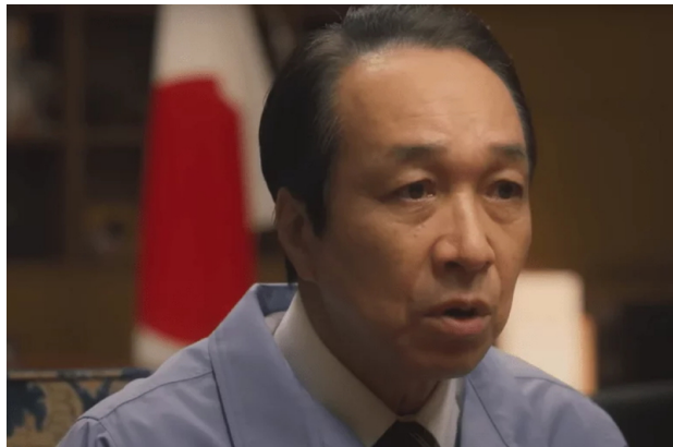
Japanese Prime Minister Kan (played by Fumiyo Kohinata) depicted as a histrionic browbeater (Netflix 2023).

The opportunity to explain how Prime Minister Kan became an international advocate for the closure of Japan's nuclear power plants, traveling the world to promote the dangers of nuclear energy in the years following the explosions and meltdowns, could have provided a powerful counternarrative contrasting Yoshida's terminal and belated ruminations. Also unmentioned is the irony of Kan being the only Japanese Prime Minister in the previous 50 years not from the ruling Liberal Democratic Party (The Economist 2021), inheriting the lax nuclear regulatory oversight mechanism that, despite ongoing scandals, the prior LDP governments had entrenched for decades and which failed so spectacularly during and after the Fukushima disaster (Kaufmann and Penciakova 2011.)