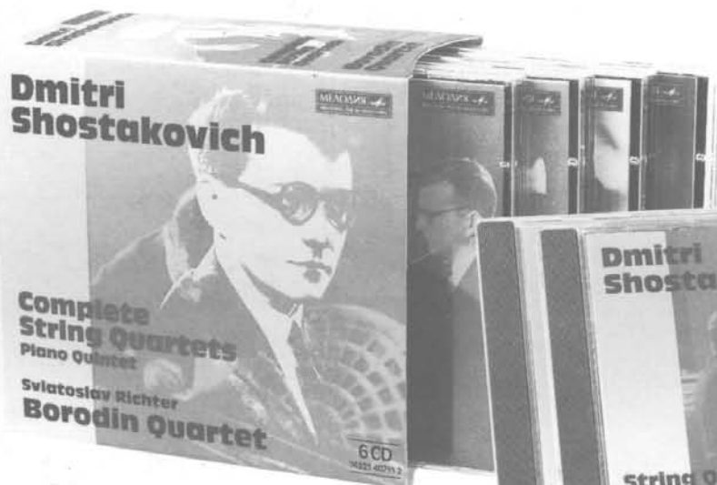
74321 40711 2 · 6 CD's (also available separately)