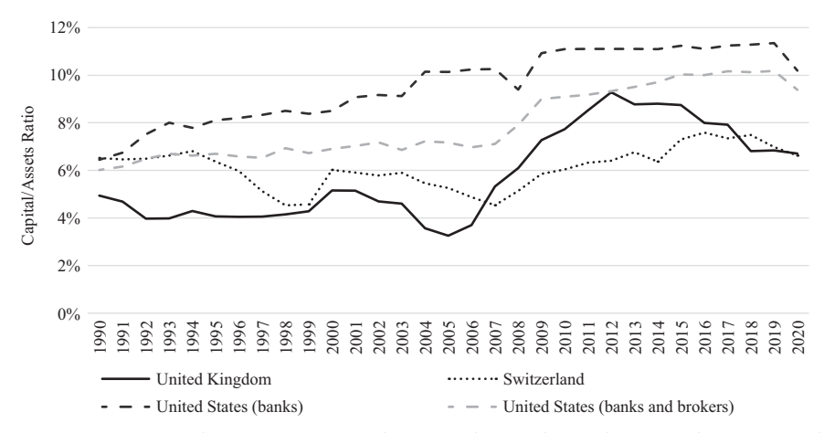
FIGURE 6.1 Capital/assets ratios in the United Kingdom, the United States, and Switzerland, 1990–2020<sup>2</sup>

banks, which increased their leverage substantially from the early 2000s.<sup>3</sup> Therefore, a second line combines banks and brokers in the United States. Overall, the leverage in the United States banking system was relatively stable from 2000 to 2007, ranging around the 7% mark, but one specific segment of the US banking market became particularly vulnerable to losses. After 2007, the banking markets of all three countries deleveraged substantially. Banks' capital/assets ratios in all three countries peaked between 2012 and 2019 at levels unseen for several decades.