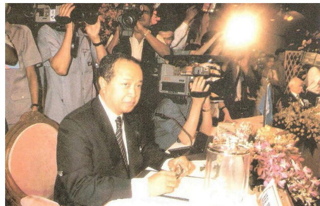
Figure 3: Co-Prime Minister Norodom Ranariddh at a press conference in 1993, 2014.

claim technocratic expertise, Hun Sen was also maneuvering to obtain the legitimacy that comes from royal lineage. To reach this goal, in the early 1990s he cemented a collaboration with the royalist National United Front for an Independent, Neutral, Peaceful and Cooperative Cambodia (FUNCINPEC, from the French acronym) led by Sihanouk’s son, Prince Norodom Ranariddh (1944–2021). Cambodia’s first democratic elections after the Paris Peace Accords occurred in 1993 under the aegis of the United Nations. The results displeased Hun Sen, who, after threatening to secede from Cambodia after FUNCINPEC won a slight majority, met with Ranariddh and the two agreed on a co-premiership of Cambodia to avoid further political disunity. This alliance was uneven from the get-go, as Ranariddh’s power and influence over decision-making waned rapidly (Chandler 2008: 290; Ang 175).