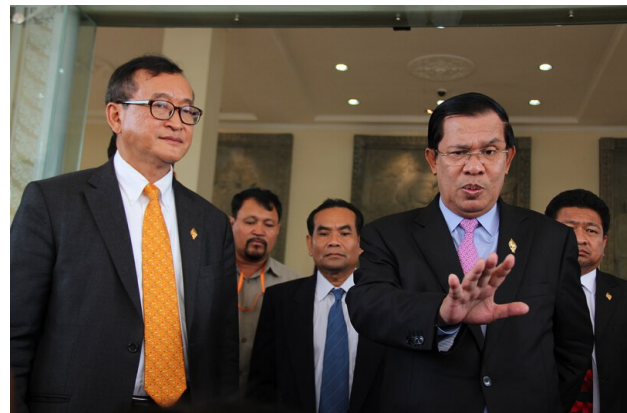
Figure 1: Cambodian Prime Minister Hun Sen (right) talks to the press with Sam Rainsy (left), leader of the Cambodia National Rescue Party (CNRP), after the National Assembly vote to select members of National Election Committee in Phnom Penh, Cambodia on 9 April 2015.

until 2008) and how he attempted to forge 'autocratic legitimation' via self-mythologization and appeals to royal imagery, all with the ultimate goal of establishing a political dynasty. The fourth shows how, through these means and heavy-handed repression, Hun Sen today has come to hold virtually unchecked, unmediated political power over a country that is still searching for the truth in its fraught post-independence history. Finally, the conclusion offers some general remarks about the current political landscape and the prospects for Hun Sen's rule.