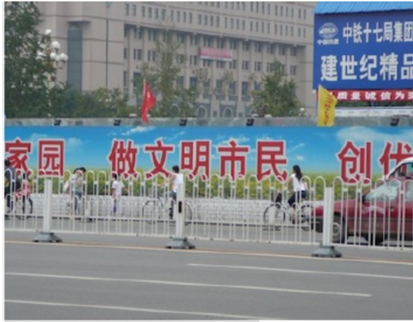
Citizens admonished to cultivate civilisation

gentry. National government would then have to be a public administration of the central state responsive to such local assemblies (Hamilton & Wang (1992), pp 144-5). Fei's reforming text is peppered with Confucian aphorisms that were addressed to junzi (the literati of pre-imperial and imperial China).