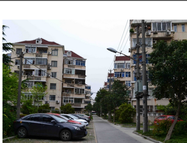
A Shanghai community.