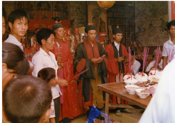
Daoists conducting offering to orphan souls in a temple in southern Fujian, 2010