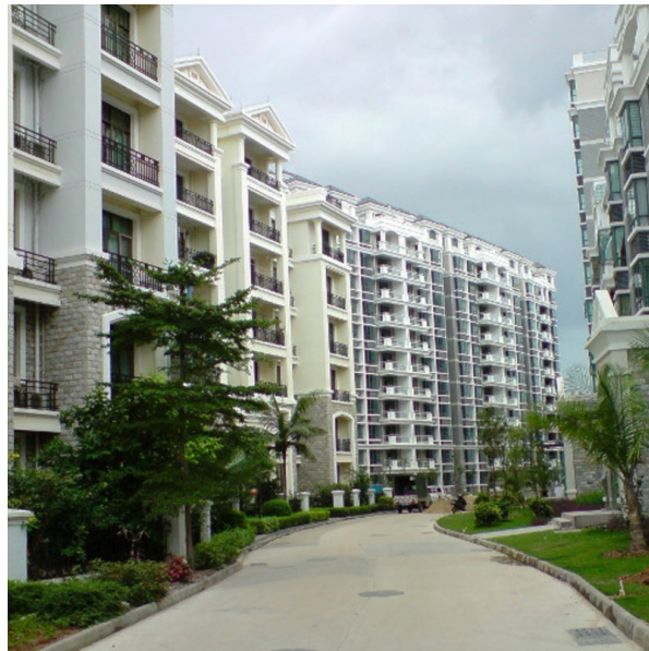
Contemporary gated community

despite state admonitions to cultivate public virtue, encourages a hedonistic carelessness about the rest of society. Cultivation has become self measured against an advertised and propagandised progressive, modern civilisation of material well being. It is cultivated in the form of rising in consumer status, in particular of private housing in guarded estates of various qualities.