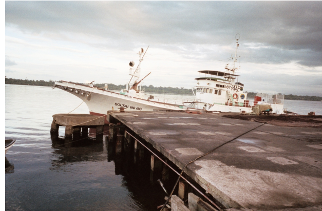
Pole and line vessel

Solomon Taiyo's main form of fishing was pole-and-line (called 'poling' in Australia and ipponzuri in Japanese) for skipjack. This is a low technology, high labor form of fishing with very low bycatch levels, and that can produce high quality meat. The skipjack fishery was in the open sea outside the reefs and lagoons. Solomon Taiyo's pole-and-line fishery had an associated bait fishery to catch small shiny silver and Western fish that were 'chummed' (scattered) live across the surface above schooling skipjack to induce a feeding frenzy and encourage skipjack to snap at the shiny hooks on the lines. The baitfish were caught by bouke-ami nets at night in lagoons using lights to attract the fish. They were stored live in wells in the hold of fishing ships to be used the following day.