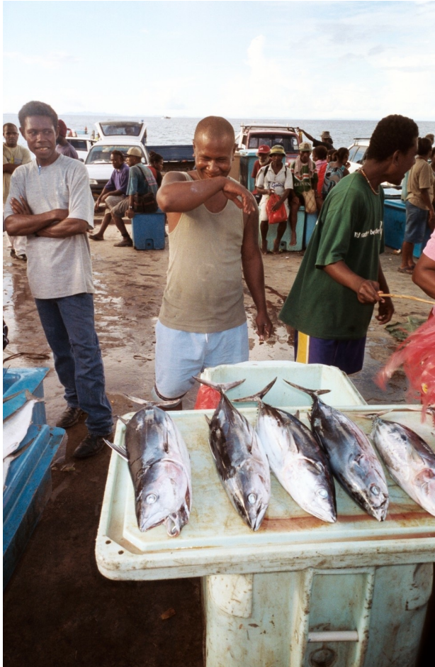
Skipjack at Honiara Market

Solomon Taiyo's main form of fishing was pole-and-line (called 'poling' in Australia and ipponzuri in Japanese) for skipjack. This is a low technology, high labor form of fishing with very low bycatch levels, and that can produce high quality meat. The skipjack fishery was in the open sea outside the reefs and lagoons. Solomon Taiyo's pole-and-line fishery had an associated bait fishery to catch small shiny silver and Western fish that were 'chummed' (scattered) live across the surface above schooling skipjack to induce a feeding frenzy and encourage skipjack to snap at the shiny hooks on the lines. The baitfish were caught by bouke-ami nets at night in lagoons using lights to attract the fish. They were stored live in wells in the hold of fishing ships to be used the following day.