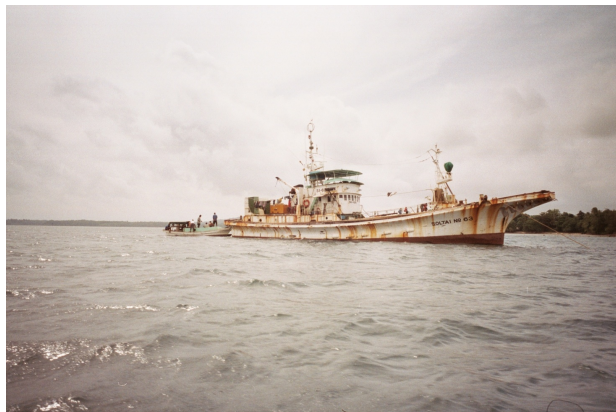
Solomon Taiyo vessel and bait boat

Solomon Taiyo grew steadily over the years until by 1999 it had an annual turnover of around USD$100 million, employed close to 3,000 Solomon Islanders on its fleet of more than twenty fishing boats, and had a large shore base with a canning factory. At start up most employees had been Japanese nationals but over the years the proportion of Solomon Islander employees increased. In 1999 there were less than ten mainland Japanese managers, and around thirty Okinawan fishermen working for the company. Up to thirty technical positions were filled by short-term contractors from the Philippines and Fiji, but the rest of the workforce, including some senior management, most middle management and technical supervisory positions, were filled by Solomon Islanders. Since the mid 1980s the company had been 51 percent owned by the Solomon Islands government, with the Japanese partner company owning the remaining 49 percent of shares, and appointments to the Board of Directors were balanced between the two shareholders.