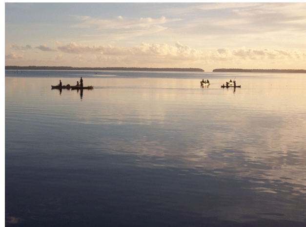
Travel brochure image of Solomon Islands fishing

Westerners who have worked closely with Japanese fisheries, such as government officials who work with Japanese government and company representatives on international fisheries issues, generally identify Japanese fisheries negotiators as 'very tough' but reliable in honoring agreements [9]. Such representations by well-informed commentators do not talk of a monolithic 'Asian' approach to fisheries, but distinguish Japan from countries such as Korea and Taiwan (and more recently China), seen as more prone to illegal fishing, breaking environmental laws and regulations, and mis-reporting catches (Schurman 1998).