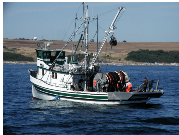
Fishing boat with purse seine

large capacity (and therefore potentially ecologically destructive efficiency) [31]. It was not just the environmental effects of purse seining that caused contention. The Japanese-favored pole-and-line method is very labor intensive, and so over a certain level of catch it is cheaper to use the very large purse seine ships with labor saving technologies. Since the 1990s purse seine caught tuna has therefore all but killed international markets for the more expensive pole-and-line caught skipjack, of which Japanese companies were the major producers.