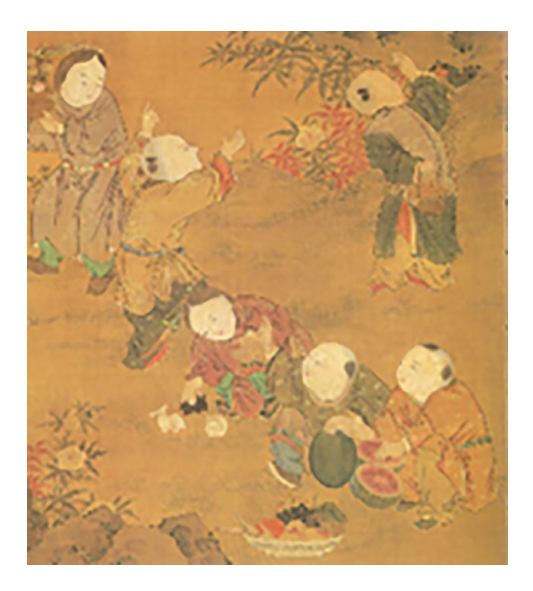
Figure 10. Children Playing amidst Autumn 秋景戲嬰 (Yuan Dynasty) (127 x 67 cm).

Were there social debates built into these cultural representations? Perhaps, though not explicitly or directly. A large painting titled Children Playing amidst Autumn 秋景戲嬰 dated from the Yuan Dynasty (1271–1368) may serve as an intriguing example (Figure 10). At the forefront of this full-sized portrait, six boys and girls are shown cracking a watermelon next to a plateful of grapes, peaches, and other fruits. A girl is petting a black rabbit crawling by two white rabbits. Children standing behind are reaching out to branches, some carrying off a bunch of flowers.