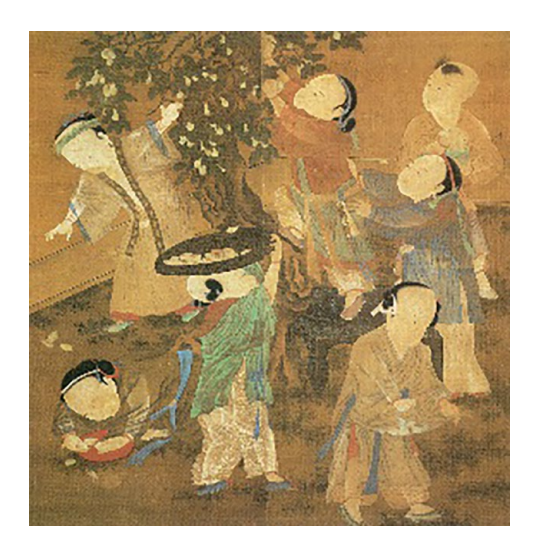
Figure 6. Fig Su Hanchen, Children Picking Dates 撲棗圖.