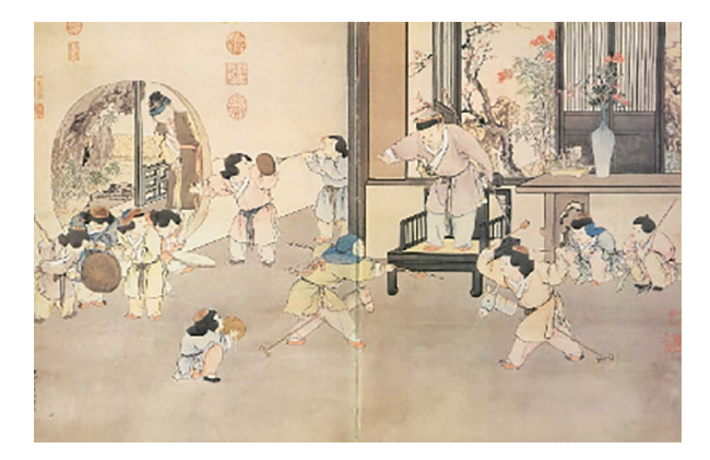
Figure 13. Jin Tingbiao 金廷標 (?--1767), Children Playing at School 鬧學圖.