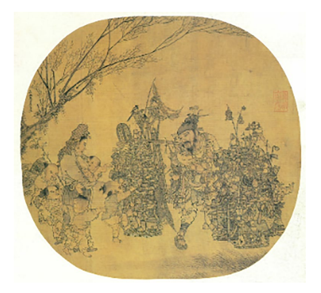
Figure 7. Li Song (fl. 1190–1230), The Village Peddler貨郎圖.

Similar to Su, other art professionals flourished in the same period, employing meticulous brushwork and closely depicting the leisurely activities of young children. In a full-sized portrait attributed to Su Zhuo, (fl. ca. 1120–1170) entitled Children Playing in the Dragon Boat Festival (duanyang xiying tu 端陽戲嬰圖), for instance, a toddler is seen with a pomegranate in one hand and a toad in the other, teasing and scaring two other little ones (Figure 5). The infantile appearance and their open-cut slacks leave little doubt as to the age group of the figures. Other examples show kids squatting on the ground and staring at bugs caught in urns, reminding the viewer of verses from contemporary poets, such as Su Shi 蘇軾 (1037–1101) and Yang Wanli 楊萬里 (1127–1206),