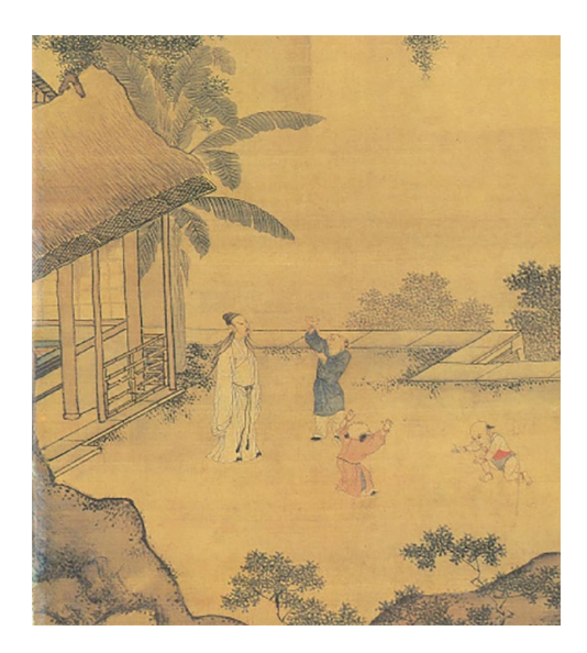
Figure 11. Zhou Chen (ca. 1486–1535), Kids Catching the Willow Flowers 閒看兒童捉柳花.

children's everyday life and their expert execution in conveying these observations through refined brushwork are careful and persuasive depictions of the very young. Unfortunately, as a genre, "children at play" has never attracted the scholarly attention it merits, but together with related portraitures such as The Village Peddler and One Hundred Children (Changchun baizi tu) , the painters of this genre present a compelling celebration of the merrymaking of girls and boys, with extraordinary technical accomplishments and undeniable passion for the subject. Their point-by-point characterization of young children deep in the happiness of patting pets, enjoying fruits, and kicking balls gave people a world in contrast to Zhu Xi's opposition to such activities as "wasteful." Viewed together with the advice from the emerging Southern Song pediatrician's cautioning against over-protection and under-exercises of elite offspring, the paintings set off an argument in the Sinic world that has continued ever since. From the collectors' stamps from celebrities and emperors added on these scrolls over eight centuries, it is also clear that for the admirers, these paintings exhibited not merely blissful scenes of healthy, plump children, but the added attraction that they were playing. The mixture of the two created an unmistaken chemistry for an auspicious life that appeals to all.