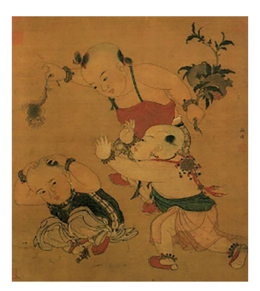
Figure 5. Su Zhuo (fl. Ca 1120–1170), Children Playing in the Dragon Boat Festival 端陽戲嬰圖 (88.9 x 51.3 cm).

Figure 4. Su Hanchen, Children at Play in the Autumn Courtyard 秋庭戲嬰圖 (197.5 cm x 108.7 cm).