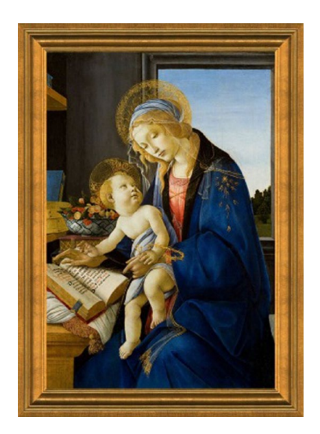
Figure 1. Sandro Botticelli (1445–1510), The Virgin and Child.