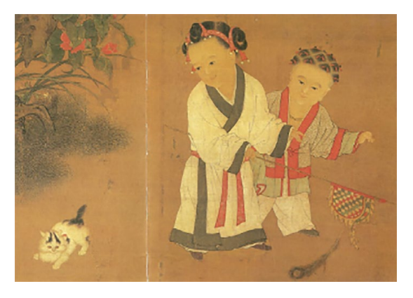
Figure 3. Su Hanchen (ca. 1094–1172), Children Playing in the Winter 冬日嬰戲圖 (196.2 cm x 107.1 cm).

fall that now are kept in the National Palace Museum in Taipei show in fine details a young girl and a young boy at leisure (Figures 3 and 4). Whether carrying a toy flag or a lure made of peacock feather used to tease a furry kitten under the weather, or playing the balancing game called "pushing the date-nut" on one of the two archaic stools set next to the Lake Tai rock in the autumn courtyard, the fact remains that people would be hard-pressed to identify these portraits depicting "miniature adults," per Ariès' thesis. Their hairdos are of the styles belonging to toddlers at three or four; their outfits, though refined, appear to be of the cut and design one would adorn only on small children. The physical proportions of their body, their eyebrows and eyes are typical for those of children, not to mention that the children Su drew consisted usually of a pair, a young girl and a young boy, with no adults around. To professional painters at this time, theirs was a respected