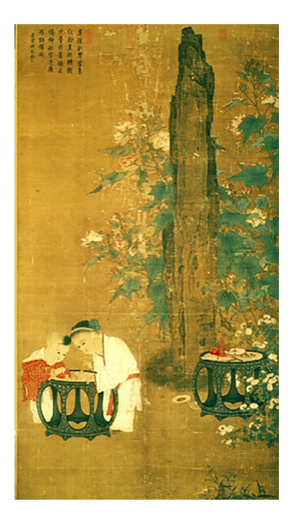
Figure 4. Su Hanchen, Children at Play in the Autumn Courtyard 秋庭戲嬰圖 (197.5 cm x 108.7 cm).