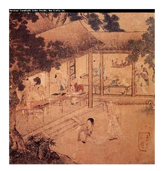
Figure 12. Qiu Ying 仇英 (ca. 1498–1552), A Village School 村塾圖.