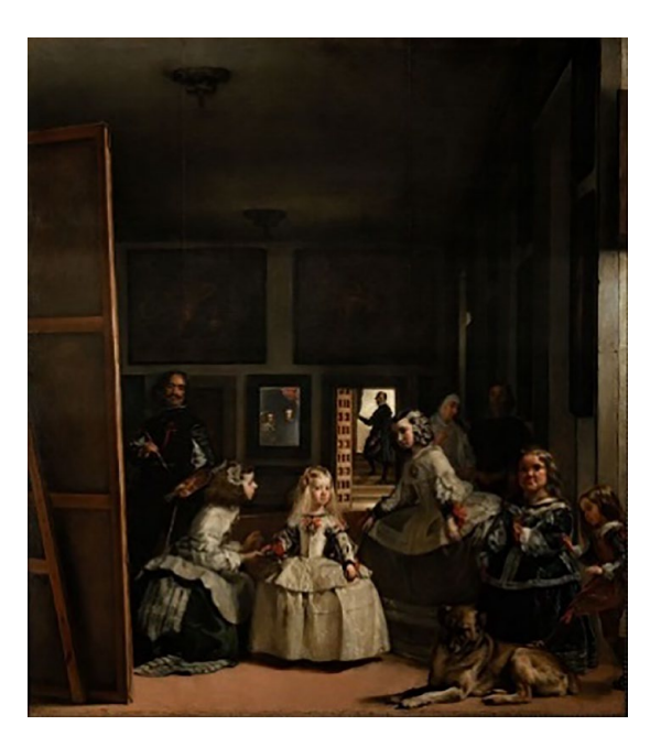
Figure 2. Diego Velázquez (1599–1660), Las Meninas, 1656–1657.