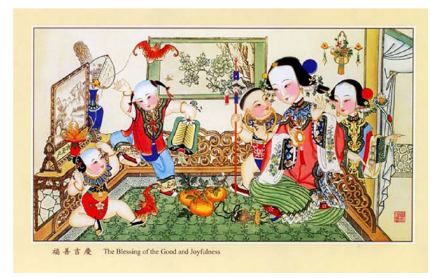
Figure 14. New Year's Painting, from the workshop of Yang Liuqing 楊柳青 Qing Dynasty.

social order, maintaining influence by re-defining behavioral codes, as the rest of society rushed to gainful employments. With boundless energy and stirred up ambitions, people were finding ways to compete, to cash in. Amidst all the commotion, the merrymaking of innocent children carried a special charm, though not without contention.