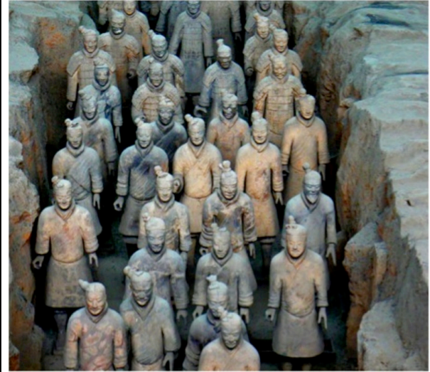
Terracotta Warriors in the tomb of the first Qing emperor

peace, both from a moral and practical perspective, in which the plight of the common people was not forgotten. The main lines of argument may be reconstructed from the texts which survived the infamous 'burning of the books' by the first Qin emperor, and they raise issues which we can interpret in terms still current today.