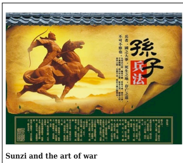
Sunzi and the art of war

The text is not a political treatise but starts at the point where the necessity of conflict is assumed, without considering the alternatives to war. However, the exercise of force is predicated on the assumption that the ruler who is making war benefits from a 'moral law' which 'causes the people to be in complete accord with their ruler, so that they will follow him regardless of their lives, undismayed by any danger'. An immoral ruler who does not satisfy his people's interests will fail regardless of his skill in the art of war 30