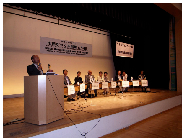
The symposium, panel discussion

domestic, let alone international, reconciliation. And in the particular case of Hokkaido where the symposium was held, whereas the Ainu have at long last been officially recognized as the indigenous people of Hokkaido, an official apology including appropriate compensation for victims is nowhere in sight.