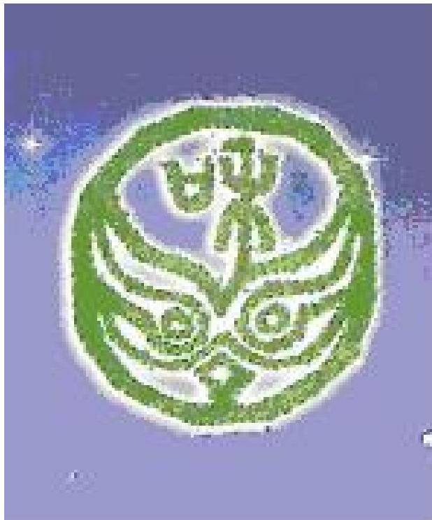
The Symposium Logo

These debates over the meanings of “ wakai ” are not limited to Japanese. The literature discussing “reconciliation” in English exhibits a number of different approaches depending on the nature of the conflict for which reconciliation is required. [7] By introducing German perspectives, and the term Versöhnung (with all the nuances that term implies following German aggression in World War II), there was much scope for talking at cross-purposes during the symposium. The symposium narrowed the focus by using the term “historical reconciliation,” that is, the attempt to restore or improve relations among groups (nations, or ethnic, religious and social groups) who experienced conflict and historical violence, in particular colonial rule or war. Reconciliation is a linear process, which integrates the past, the present and the future of parties that seek the recovery of relations among themselves. It can be realized only in relation to others, and does not imply a unilateral peace but a relational peace.