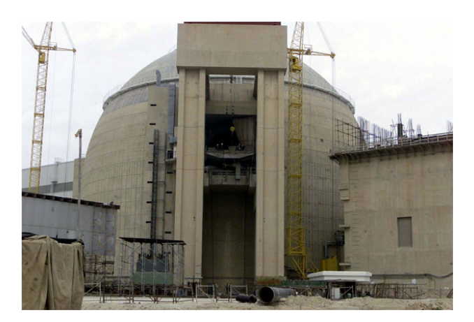
The main building of the Bushehr nuclear power plant (2003)

nuclear power plant in Iran. Indeed, Russia has "politicized" the issue and is unlikely to dispatch nuclear fuel for Bushehr as long as the Iran nuclear file remains open. Despite the chill in Russian-US relations, Washington and Moscow have always closed ranks on issues affecting the preservation of the "nuclear club".