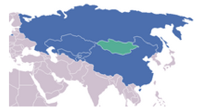
Map showing SCO military exercises centered on Xinjiang

The government-owned China Daily underlined that the exercises show that "SCO cooperation over security has gone beyond the issues of regional disarmament and borders, for it includes how to deal with non-traditional threats such as terrorists, secessionist forces and extremist religious groups".