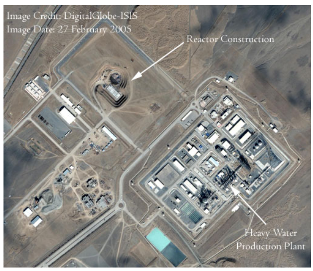
Arak heavy-water plant in 2005 satellite image

and as evidence that "Iranians are ready to give the IAEA exhaustive answers".