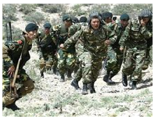
SCO military exercie in Kyrgyzstan

Volga-Ural military district and in Urumqi, capital of China's Xinjiang Uyghur autonomous region. The SCO summit is scheduled to take place in the Kyrgyz capital Bishkek on August 16. After the summit, in a highly symbolic gesture, the heads of states and defense ministers of all SCO members - China, Russia, Kazakhstan, Kyrgyzstan, Uzbekistan and Tajikistan - will watch the conclusion of the joint military exercise in Urumqi.