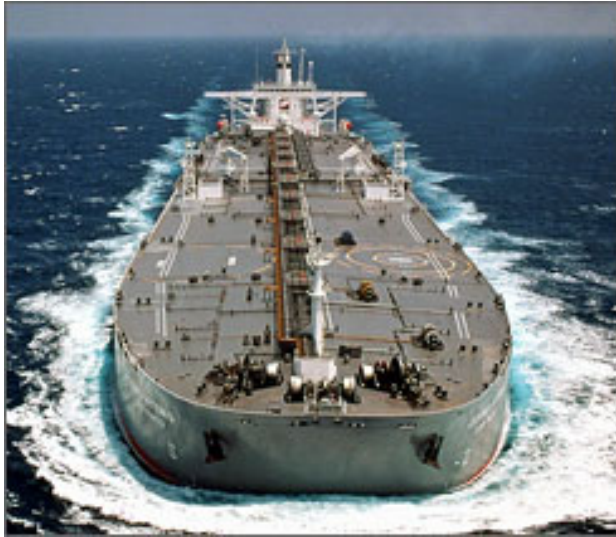
Japanese-operated oil tanker Bright Artemis