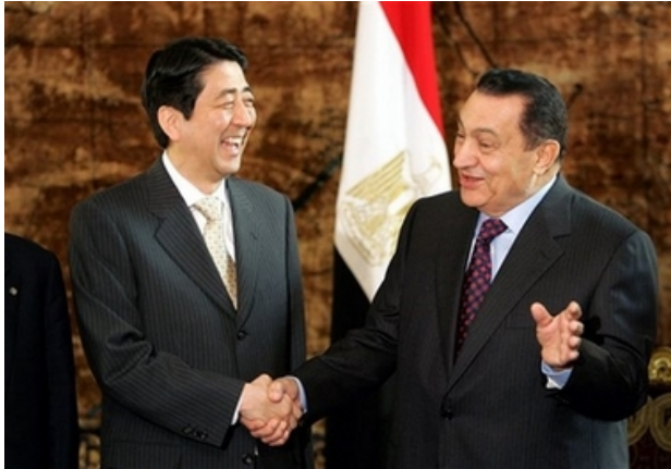
Abe and Pres. Mubarak

The Middle East leaders welcomed a greater role for Japan in the Middle East peace process. In separate joint statements issued after their leaders met with Abe, Saudi Arabia, the UAE and Egypt also specifically expressed their appreciation for Japan's efforts in supporting the Middle East peace process, such as the concept of the "Corridor for Peace and Prosperity."