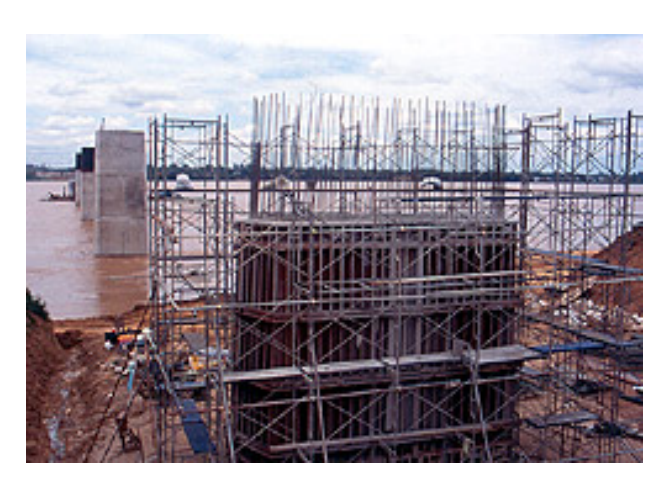
Second Mekong Friendship Bridge in construction

southern Laos, Mukdahan in northeastern Thailand and then Mawlamyine in southern Myanmar. This project was almost completed at the end of last year.