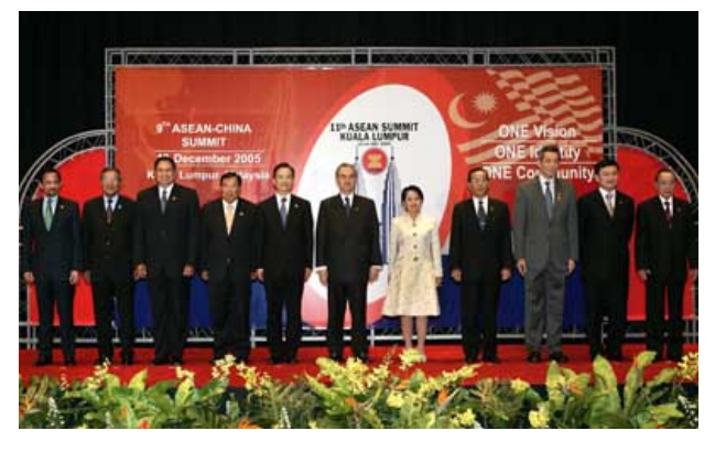
Leaders at the China-ASEAN Summit, Kuala Lumpur, Dec 5, 2005

The Sino-Japanese tug-of-war over greater influence in Southeast Asia has also opened a new front - the Mekong River basin. Moves by Japan and China to help the development of the Mekong River basin have intensified in recent years.