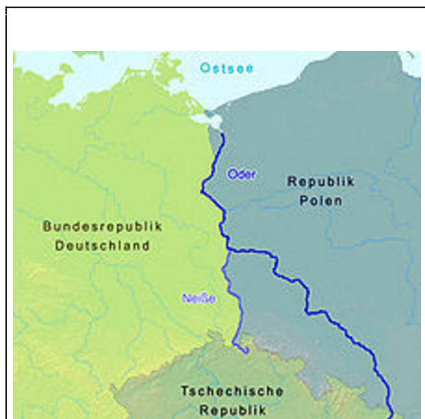
The 1970 Warsaw Treaty between Germany and Poland settled outstanding border issues with the Oder-Neisse line

The second stage of history’s shaping role in reconciliation, Germany’s acknowledgment of grievances, involved converting the affective, moral component into pragmatic and material needs and formal political commitment. In the Polish case, as with France, Israel and the Czech Republic, the acknowledgment entailed the language referring to historical issues in bilateral treaties and in major statements as well as symbolic expressions of reconciliation. For example, the December 1970 Treaty between the Federal Republic of Germany and the People’s Republic of Poland on the Basis for Normalizing Their Relations acknowledged Poland as “the first victim” of a murderous World War II and recognized the Oder-Neisse line as Poland’s western border, albeit de facto and not de jure. 13