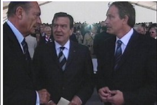
Chirac, Schröder and Blair at D-Day

prolonged German unwillingness to provide restitution to Czech victims of Nazism; and the planned Expulsion Center in Berlin. In the case of Israel, the past has also returned, both in the statements of the German literary figure Martin Walser about the oppressive obligation to memorialize the Holocaust, and in anti-Semitic statements of the mainstream German politicians Jürgen Möllemann (FDP) and Martin Hohmann (CDU). Like Polish leaders, Israeli leaders have warned Germans not to confuse victims and perpetrators. Concerning anti-Semitism in Germany, while the Israeli government has expressed concern, as Germany's partner in reconciliation it has also lauded the German government's efforts to combat this phenomenon. There are also recent, outstanding restitution issues for some citizens of Israel, which the German government has refused to recognize. We should note, however, that Germany has paid 62 billion Euros in total restitution and reparations payments since 1952 (about one third to individual Israelis and the state of Israel). Even in Franco-German relations, where the past has played a lesser role than in the cases of Poland, Israel and the Czech Republic, there was significant concern over President Jacques Chirac's 2004 invitation to Schröder to attend the commemoration of the sixtieth anniversary of D-Day.