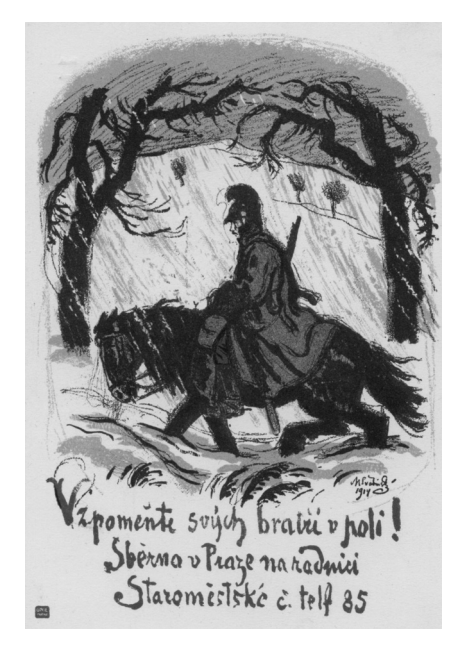
Figure 2.1 Postcard with the drawing by Max Švabinský: "Remember your brothers in the field!"

Office into thousands of postcards to be sold for the war effort.<sup>86</sup> Yet another much-used image in posters and badges represented a crying mother veiled in black holding her child up to face the viewer. Behind her, an angel comforted her. A large poster by the local branch of the Imperial Widow and Orphan Fund, for example, featured the black and white drawing and invited every Czech to do his duty to the homeland by helping these children.<sup>87</sup> This image, also used in campaigns in Vienna and in subsequent funding appeals, shows a similar use of suffering as a means of patriotic mobilization.<sup>88</sup> "Social patriotism" was harnessed as a powerful tool in service of the Austrian war effort.