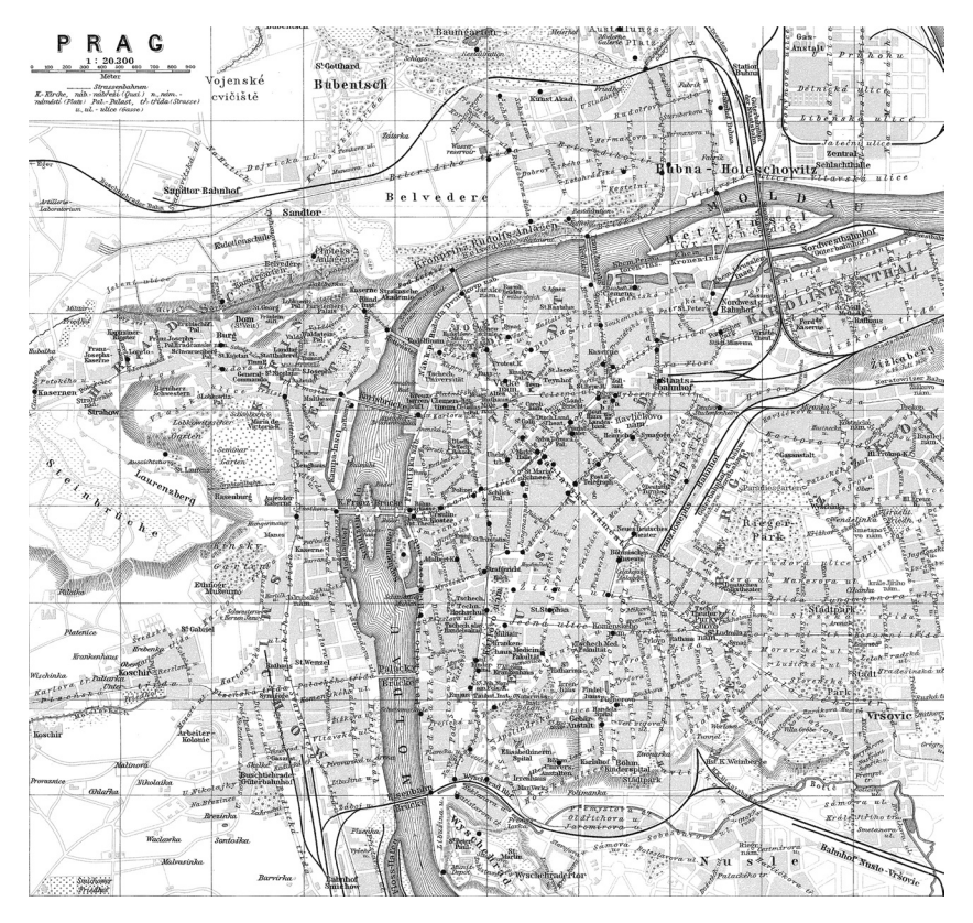
Map 2.2 Collection points in the inner city during the Red Cross week (April 30 to May 7, 1916)

in a fundraising drive for the benefit of returning soldiers. Most of them were located on busy street corners where passersby were likely to stop. There was a high concentration in the center of the city, especially around the most animated thoroughfares Ferdinand Avenue and Am Graben/na Příkopě, and on the main squares (Wenceslas Square, Joseph Square near the Powder Tower, Charles Square, and Old Town Square). Train stations, churches, and famous restaurants or cafés constituted other central points for the fundraising efforts. Walking through the streets of Prague on those days, it would have been hard to avoid the collections, be it on the city's bridges, in public parks, or in front of the main shops.