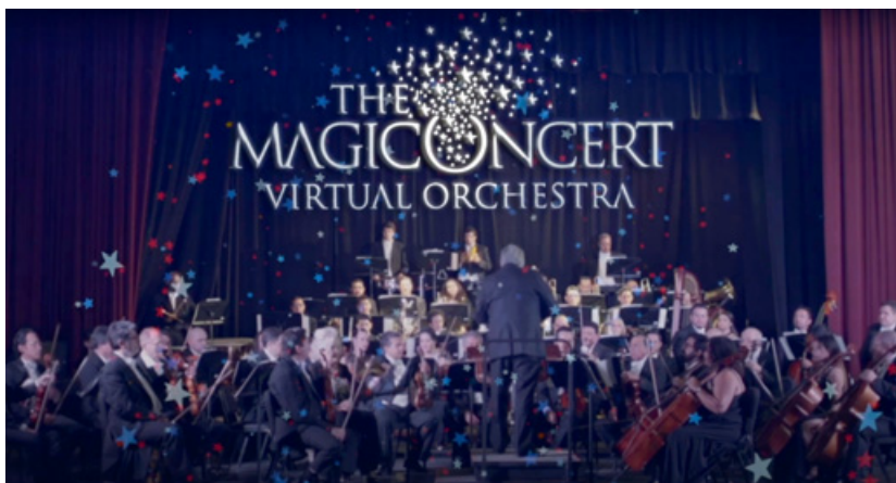
Video Example 1 MagiConcert Virtual Orchestra.

possible uses of such a MagiConcert Virtual Orchestra in an increasingly digital age. This is especially true in the wake of the COVID-19 pandemic and the shift toward remote performance on platforms such as Zoom and Webex – not to mention the possible creative uses of such technology in conjunction with artificial intelligence.