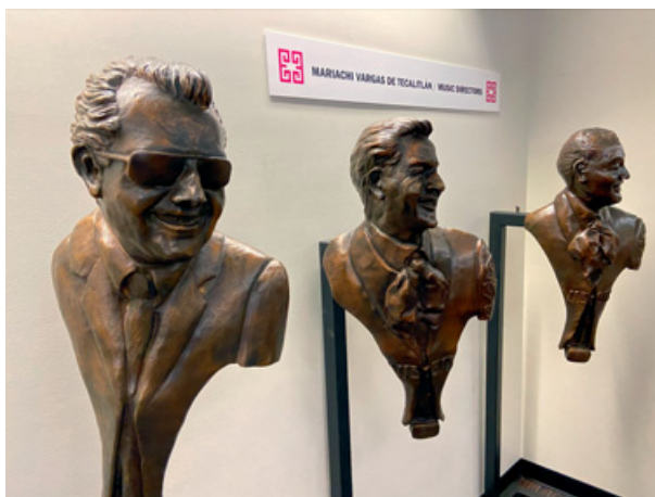
Figure 4 Some of the busts on display, featuring music directors of Mariachi Vargas, Southwestern College Library, March 2023.

convenient to peruse the displays between classes or on study breaks, making it an ideal setup for those wishing to appreciate it on multiple visits. On the other hand, the layout may be confusing to a first-time visitor or seem disjointed. This is especially true as one attempts to navigate sections of the exhibit that are spread out along the library's outer walls rather than consolidated in a dedicated room or wing. For visitors not affiliated with Southwestern College, the touring experience may also feel uncomfortable, possibly even intrusive, as one moves between sections near students who use the library for study and research. Another possible problem is that the museum space competes with a more "traditional" library culture at Southwestern. Librarians encouraged those of us on the tour, even Nevin himself in his role as curator at one point, to keep our voices down lest we disturb patrons. 14 Many displays included signs with QR codes that link to audio or video recordings of songs and interviews with mariachis. Unless the visitor saves these QR codes to explore after the tour, the quiet library culture at Southwestern necessitates enjoying these on one's own, presumably with headphones. The most satisfying visitor experience might therefore come from