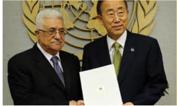
Palestinian President Mammoud Abbas with UN Secretary General Ban Ki-moon

Since then, however, there has been a backlash against the extreme anti-Islam policy of the United States in the form of an anti-U.S., anti-Israel Islamist movement; since the revolution in Egypt last spring, Islamism has been accelerating under the rubric of democratization. Previously pro-Israel Egypt and Turkey have since turned anti-Israel, and the Palestinian Authority, once a puppet of the U.S. and Israel, is increasingly defiant in its attempt to gain United Nations membership. Even in formerly secular Tunisia and Morocco, the Islamists are rising in the elections .