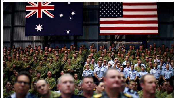
American Marines and Australia Soldiers listen to Obama address in Darwin, Australia

In his remarks to the Australian parliament on November 17, President Obama declared that the U. S. was making the Asia-Pacific region a top priority. While promising a continued U.S. military presence in the region, Obama also expressed his intention to strengthen U.S.-China cooperation. This declaration, however, was made at the same time as Obama announced a series of anti-China measures: to station U.S. forces permanently in Australia for the first time, to promote the Trans-Pacific Partnership (TPP) – a multilateral trade agreement that excludes China – and to discuss the South China Sea Islands at the ASEAN summit, to Beijing’s displeasure. Therefore, the Japanese media view Obama’s emphasis on Asia as strengthening an anti-China containment ring.