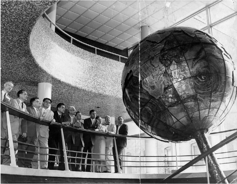
Figure 5.2 First International Conference on Oral Polio Vaccine at PAHO headquarters in Washington, 1959.

divided the East and West, while varying healthcare and economic structures had a direct effect on the choice of the vaccine (i.e. to stick with the hitherto-used Salk vaccine or change to Sabin), as well as the speed of introduction and licensing. Furthermore, differences in welfare systems and socialised medicine, a sensitive point in Cold War concerns, influenced the efficiency of vaccine application.