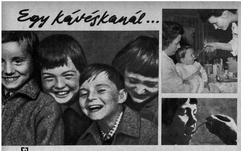
Figure 5.3 'One teaspoon . . .'. Feature article in A Hét , 18 June 1961, no. 25. 8. This image is protected by copyright and cannot be used without further permissions clearance.

when the professor was visiting the State Hygienic Institute in 1960. According to Bakács' memoir,