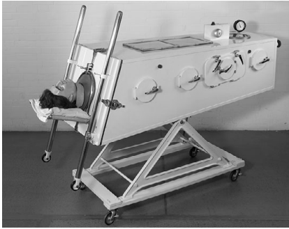
Figure 2.1 Both-type iron lung, London, England, 1950–55. By Science Museum, London. Credit: Science Museum, London. CC BY. This image is protected by copyright and cannot be used without further permissions clearance.

seesaw, used gravity to help breathing. Internal organs pushed and pulled the diaphragm as the body swayed up and down in a lying position.