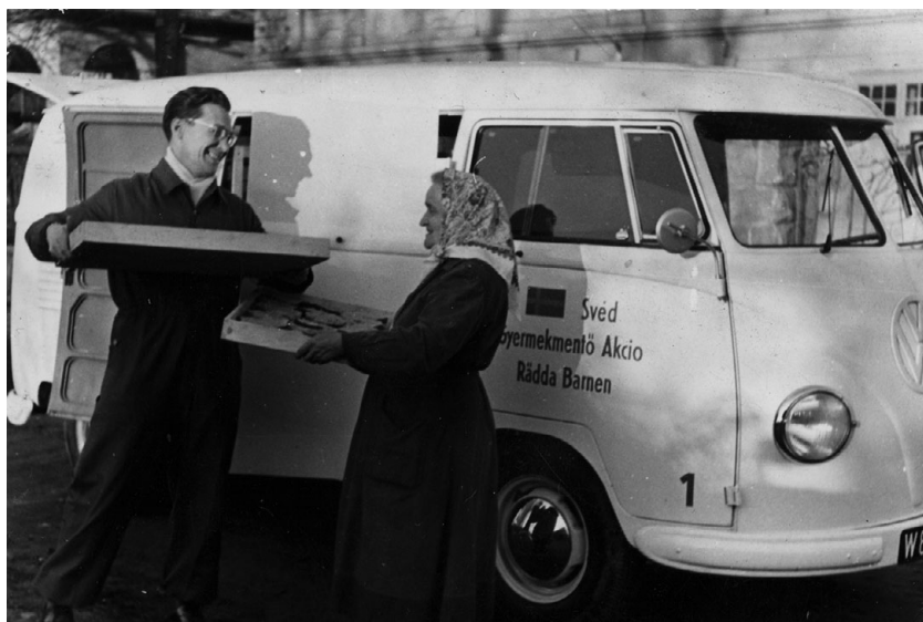
Figure 2.2 Aid arriving from the Swedish Rädda Barnen. Hongrie 1956–57. Budapest.