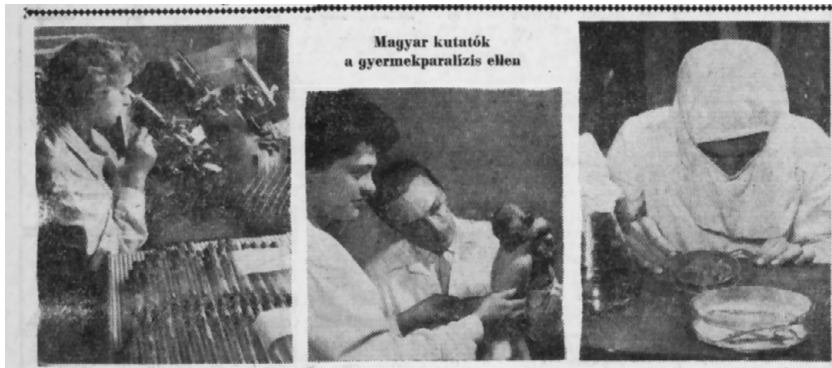
Figure 4.1 Hungarian researchers against poliomyelitis . Népakarat, 18 September 1957, 2, no. 218, 1. Credit: Arcanum Digitecha. This image is protected by copyright and cannot be used without further permissions clearance.

Népszava in April, the majority did not show up at the immunisation points. Therefore, they were called upon by the newspaper to attend their vaccination before the epidemic months of the summer began. 18