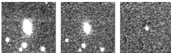
Figure 1. A possible supernova. From left – reference image, night1, subtracted image.