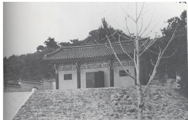
Hyönch'ungsa Reliquary 1968 35