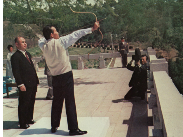
Park Chung Hee at Archery Photo Shoot, Hyŏnch’ungsa 1973 87