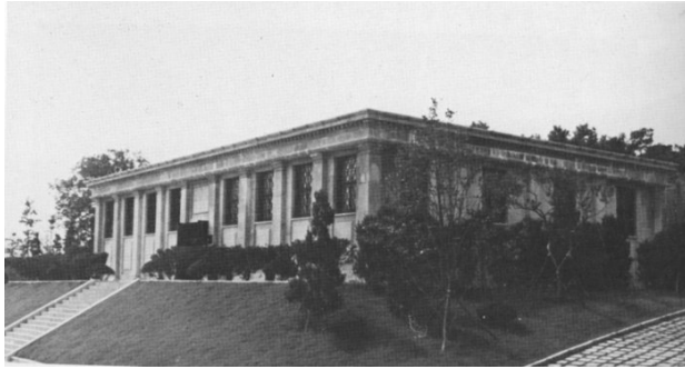
Hyönch'ungsa Reliquary 1973 36