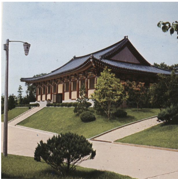
Hyönch'ungsa Reliquary 1975 37

The first picture shows a hamlet with straw roofs. The shrine itself is not easily visible. Taken almost a decade later, the second picture reveals a landscape dominated by the shrine. Private homes are no longer visible in the line of sight.