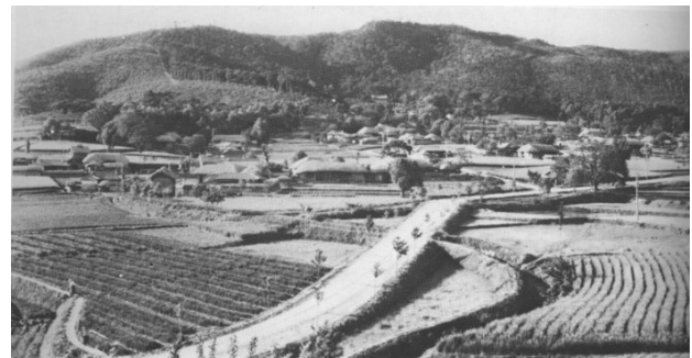
Hyönch'ungsa Environs April 1966 39

Photographs in government publications also emphasized the rapid transformation of the shrine into a modern national site. In the second edition of the Record of the History of Asan Hyönch'ungsa , recent color pictures heightened the transformation of the shrine by providing a sharp contrast with the black and white unfocused pictures taken in the first phase of construction.