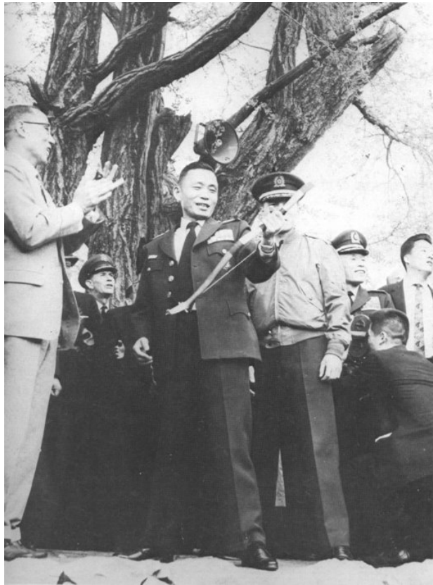
Chairman Park with a Chosŏn bow in 1962 75

curved Chosŏn bow. Later photographs show a much more carefully staged affair, with the famously short president alone on an elevated stage, posing with a drawn bow for photographers and videographers.