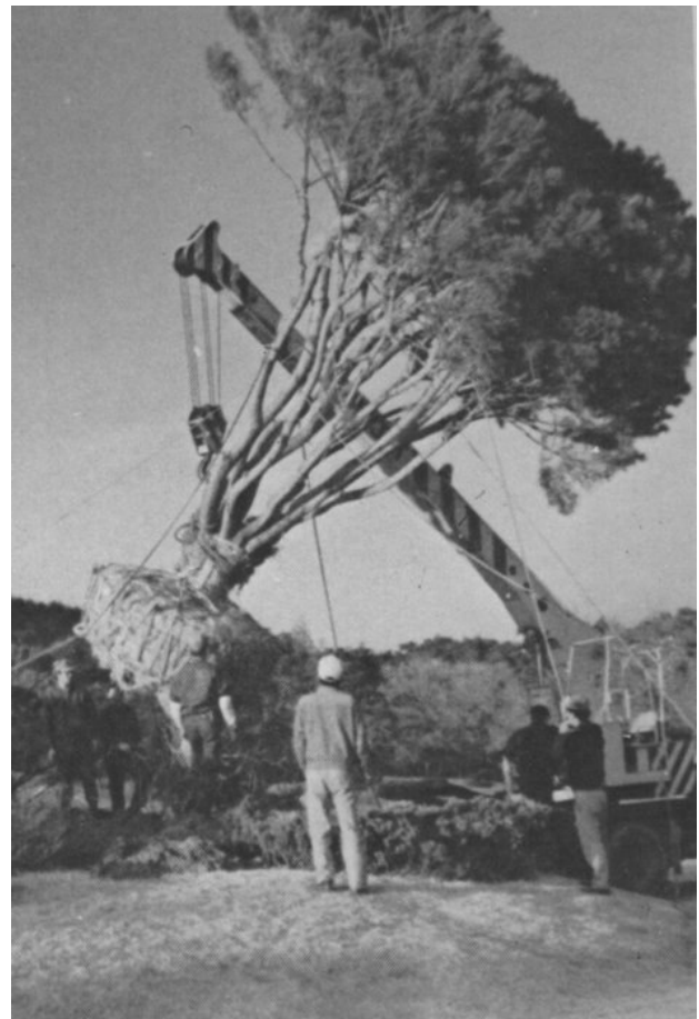
Planting Large Trees at Hyŏnch'ungsa, 1975 30

In the twentieth century remaking of Hyŏnch'ungsa, Park expressly ordered the ministries to buy up farmland to add to shrine grounds in order to transform them to green lawns. 27 Gardens were to be ornamental. The primary goal of the new flora on shrine property was to reflect the magnificence of the Admiral, suggesting "grandeur" ( changŏm ) or "solemnity." 28 Park repeatedly demanded that landscapers plant larger and older trees that would suggest a longer history for the new Hyŏnch'ungsa. 29 Traces of former farming activities such as irrigation ditches were to be covered or removed.