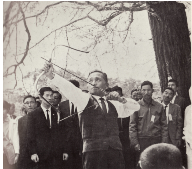
Park Chung Hee at Hyŏnch'ungsa 1967 76

How are we to read these images? How was the annual archery demonstration an iconic moment in Park's becoming Yi Sunsin? And why choose archery? Yi Sunsin was not especially famed as an archer; furthermore, while his writings as well as the hagiographic essays compiled after his death acknowledge his childhood propensity for military arts, ultimately they privilege his literary leanings.