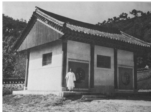
Hyönch'ungsa Reliquary 1962 34

was a sharp contrast from the other traditional structures and preceding reliquaries. But in 1974, its external appearance was "Koreanized" through cosmetic changes—adding a new Chosŏn style tile roof with sloping eaves and newly painted mock columns to the structure. The new hybrid building perhaps better reflected the duality of the reliquary itself, as a museum dedicated to propagating a select image of the Admiral through the preservation of his writings and personal effects, and as a new institution that had no counterpart in the Chosŏn past. Like the new shrine complex, the reliquary's legitimacy was founded on its claims about the past, yet it was a firm creation of the present.