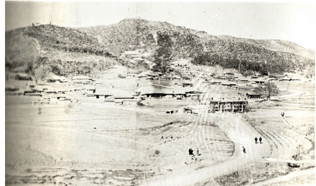
Hyönch'ungsa February 1966 38

The first picture shows a hamlet with straw roofs. The shrine itself is not easily visible. Taken almost a decade later, the second picture reveals a landscape dominated by the shrine. Private homes are no longer visible in the line of sight.