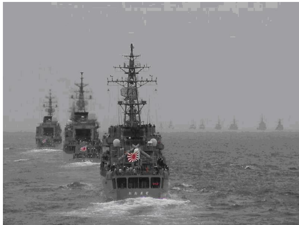
Japan's coast guard in the East China Sea

Japan has been competing over scarce energy resources with China. The two energy-hungry Asian powers have been locked in a simmering dispute over gas reserves in the East China Sea. Furthermore, they have each lobbied hard for alternative routes for a pipeline from eastern Siberia's oilfields to Pacific Rim nations. The Sino-Japan rivalry over energy resources shows signs of spreading to the Middle East.