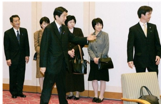
Abe and five abductees who were returned to Japan. February 25, 2007

interest and maintained a powerful tool to punish North Korea for lack of progress. Some may conclude that narrow domestic political interests simply prevailed over broader strategic purposes. At a deeper level, however, Abe's policy may be thought of as a conscious attempt to set the bilateral and multilateral political agenda in a context that is framed by a North Korean regime first and foremost interested in negotiating with Washington. Tokyo is generally relegated to the sidelines, expected to provide economic assistance when time is ripe. With little to lose bilaterally and lots to gain domestically and strategically, Abe insisted on this one issue. An obstructing stance furthermore assures that multilateral engagement does not move too fast without real concessions from Pyongyang.