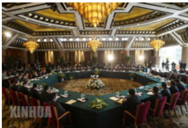
The Six-Party Talks negotiating table (entrance behind PRC seat).

From a security perspective, Japan's concerns over North Korea's nuclear and missile programmes appear to be at odds with its (in)action in negotiations addressing these issues. When taking a closer look, however, it becomes apparent that while Tokyo recognizes Pyongyang as the greatest threat to Japan's national security, Pyongyang provides also a welcome justification to the Japanese government for the enhancement of Japan's security capabilities. The North Korean threat creates leeway to pursue a more proactive military policy and create more offensive capabilities for broader (collective) defense purposes. The abductee issue serves to give the