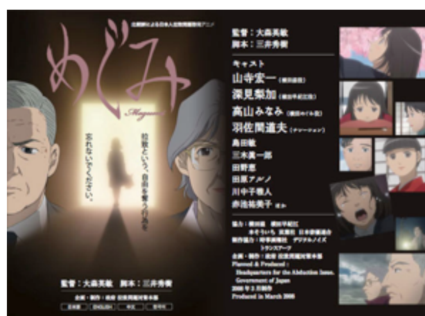
Poster of the animation film 'Megumi', released by the Japanese government internet television in March 2008 and available for free rental in video

The prime ministers who ruled Japan since the initiation of the Six-Party Talks in 2003 have taken very distinct policies with regard to North Korea. [22] Unsurprisingly, changes in bilateral policy did not fail to leave their impact in the multilateral setting. Prime Minister Koizumi Junichiro revamped bilateral talks in 2000 through the resumption of formal normalization talks, which had been stalled since 1992. He left an important legacy with the first bilateral summits in history, in September 2002 and May 2004. This engaging approach went against the course of President Bush, who early in 2002 famously included North Korea in an 'Axis of Evil.' During the first summit Koizumi and North Korean leader Kim Jong-il adopted the Pyongyang Declaration, which formally stated that both sides would 'make every possible effort' for an early normalization of relations. [23] The Japanese government moved away from Koizumi's conciliatory approach, however, when it stalled official talks in 2002 due to its dissatisfaction with Pyongyang's handling of the abduction issue. [24]