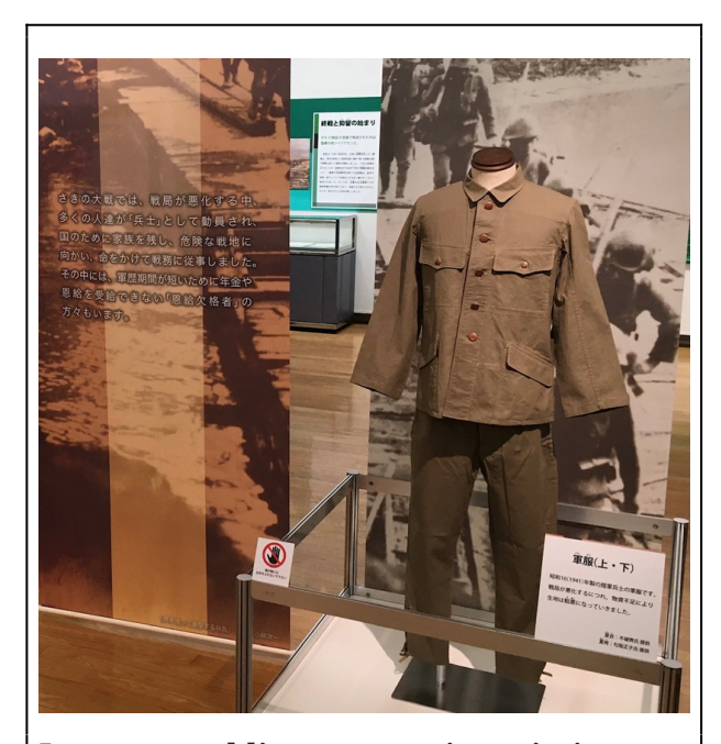
Japanese soldiers as wartime victims: an exhibition on postwar Japanese internees in Siberia, Fukuoka, November 2019

depicted), the exhibition text acknowledged that many internees were soldiers. However, it stressed that many had been forced into uniform as "the state of the war worsened" (戦 局が悪くなる中) (see Figure 1). "Leaving behind their families for the sake of the country," a prominent plaque declared, they "headed for the dangerous frontline," with many survivors eventually returning to pensionless poverty. In a manner typical of public discourse under the Abe premiership, the (undoubted) suffering of many Japanese is piously hailed as patriotic sacrifice, while empathy for the Asian victims of Japanese aggression is entirely absent.