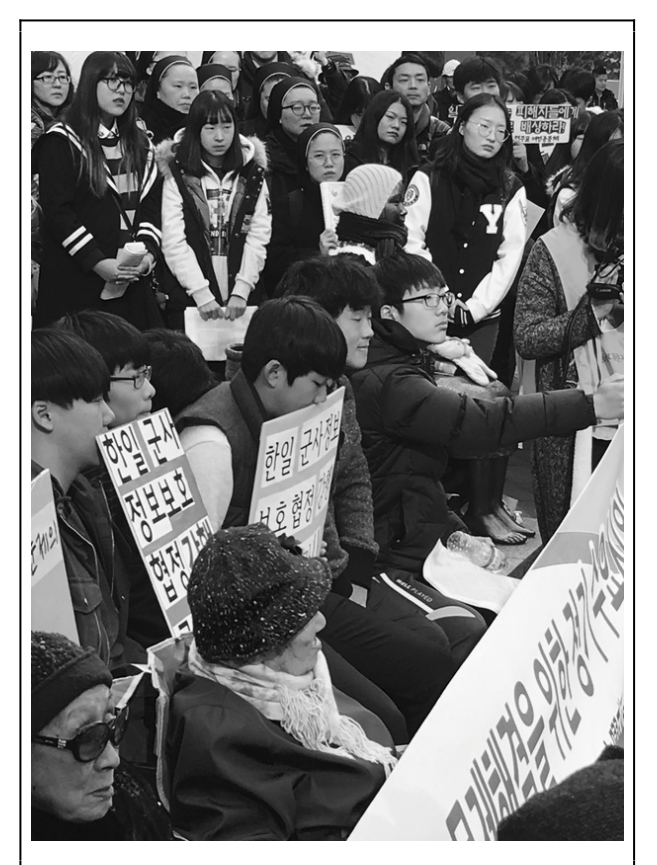
Wednesday Demonstration outside the Japanese Embassy in Seoul, with the 'Statue of a Young Girl' centre-stage

official apologies (without any public restatement from Abe); on the other, within Japan, efforts continued to expunge mention of comfort women from school textbooks and wider public discourse within Japan.<sup>27</sup>