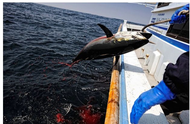
Nishi Kanji pulls out a bluefin tuna from the waters of Iki Island, Nagasaki

Catch data from Katsumoto, the main port on Iki Island in Nagasaki Prefecture, shows that while some 358 tons of Bluefin were unloaded there by the island’s 400 ippon-zuri (single rod and line) fishermen in 2005, they brought home just 23 tons in 2014.