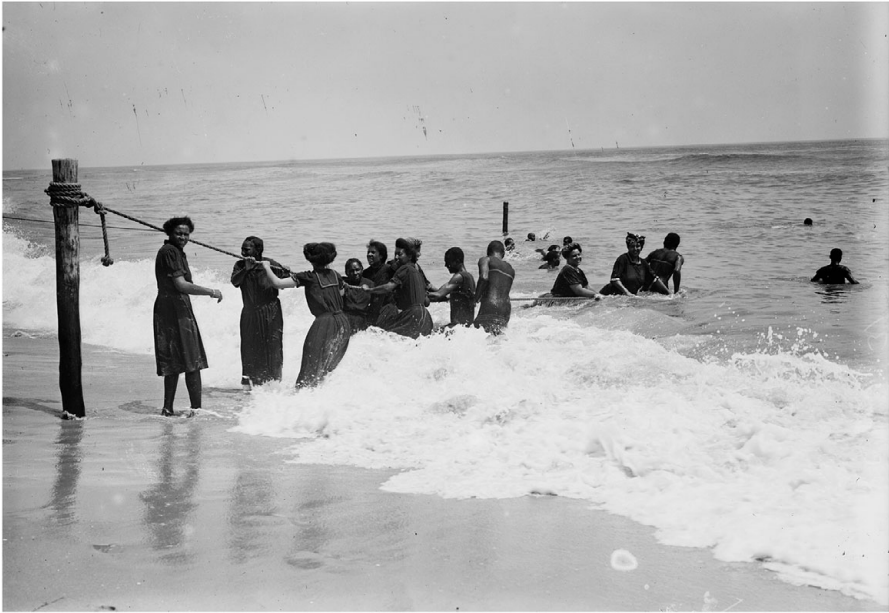
Figure 1. Black beachgoers at Asbury Park, New Jersey, 1908. "Negroes, Asbury," LC-B2-432-8, George Grantham Bain Collection, Library of Congress Prints and Photographs Division.

persistent proscription, under the thousand little annoyances and petty insults and disappointments of a caste system, they lose the divine faith of their fathers in the fruitfulness of sacrifice." He added that "true amusement, true diversion" allowed for the "re-creation of energy which we may sacrifice to noble ends, to higher ideals." 35 In other words, adults could not expect youths to invest in the struggle for freedom if they placed limitations on their enjoyment, particularly when young people were already subject to daily forms of racism that restricted Black autonomy. Seemingly, these overlapping constraints on freedom, from both Black adults and white agitators, did not have inspiring effects and provided poor lessons in Black self-determination. Indeed, thousands of compounded "annoyances," "insults," and "disappointments" characterized the Nadir and may have left some feeling too dismayed to perform important race work. According to Du Bois, both intraracial and interracial strictures on recreation proved counterproductive to fostering an energized Black youth that would embody "higher ideals" and not hesitate to sacrifice their lives "on the altar of their race."