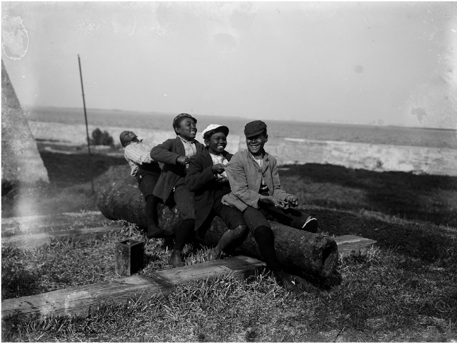
Figure 2. Although likely staged, this image, taken in 1902, demonstrates the possibility of Black joy at approximately the time that, according to Rayford Logan, African Americans had reached a point of declension. White photographer and explorer William Henry Jackson took this photograph, possibly at Castillo de San Marcos in St. Augustine, Florida. “Four black boys sitting on a cannon by a waterfront,” LC-D4-30806, Detroit Publishing Company Photograph Collection, Library of Congress Prints and Photographs Division.

On a snowy day in February 1899, Black schoolchildren in Virginia did what many young people do in cold weather—they had a snowball fight. The children’s “snowballing” during a particularly heavy storm “filled the youth with joy,” “great zest,” and “good humor.” 42 Indeed, anyone who has participated in a snowball fight can relate to these young people’s exhilaration—the sensorial pleasure of molding soft snow into a dense globe, the thrill of “hitting” your target, and the elation of watching large snow clumps burst into a cloud that covers your playmate in white dust (being “hit” could also be pleasurable). This innocent snowball fight among Black children may appear to be an ordinary amusement, but it could have felt more consequential in the context of the segregated South. The joys of “snow-balling” may have offered a momentary salve for the injury of recreational segregation or an indulgence that counteracted the bitterness of being deprived of parks, pools, and playgrounds. Perhaps the activity did not hold this kind of weighty significance drenched in racial meaning, but rather, was a simple, fun afternoon spent romping in the snow. After all, the Southern Workman reported on the occasion under its “Every Day Affairs” section of the Hampton School Record, suggesting