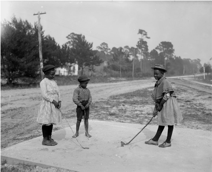
Figure 3. Pictured are two Black girls and a Black boy using tree limbs as clubs and a pinecone as a golf ball, circa 1905. Like the young people who may have experimented with the “fly see saw,” Black children turned to natural resources for their amusement during the Nadir. “Golferinos,” LC-USZ62-77635, Library of Congress Prints and Photographs Division.

African American children also gravitated toward pleasurable activities requiring more inventiveness. The Rising Son , a weekly Black newspaper based in Kansas City, Missouri, thought young people would enjoy making, as curious as it sounds, a “fly see-saw.” To assemble the device, children would place molasses or syrup on both ends of a strip of paper and balance the strip on top of a pencil. The Son instructed the players to wait for flies to land on the ends of the contraption, in essence creating a seesaw that served as a toy. The seesaw could be used individually or played competitively as a game, in which case the winner would be the player who accrued the most flies on their side of the device. Constructing the toy, anticipating its functionality, and watching its successful execution may have offered, at worst, a feeling of moderate satisfaction and, at best, genuine amusement. If played collectively, it could have produced a sense of shared wonder, discovery, and camaraderie. Transforming flies, often viewed as symbols of poverty, into sources of pleasure was “an amusing little trick” that the paper believed young people “would find lots of fun.” 43 A simple “fly see-saw” may have momentarily combated feelings of disappointment and disenchantment experienced by Black children of the Nadir. Observing children tinker with this peculiar toy