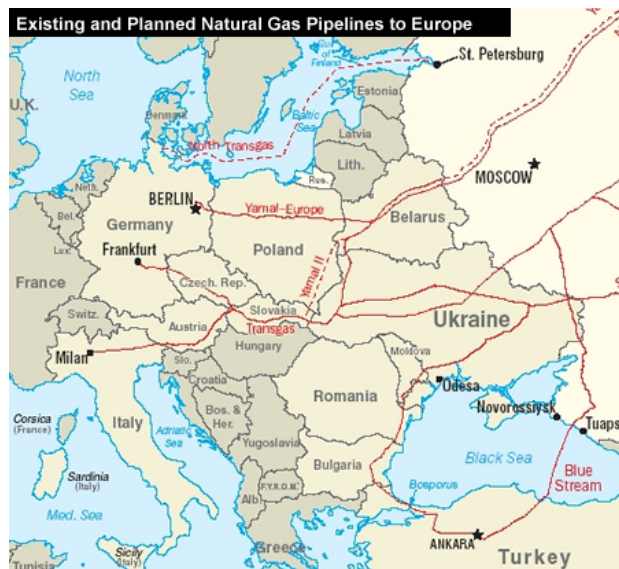
Russian oil and gas routes

The EU's blueprint of its new Central Asia strategy, to be adopted at the EU summit in June, will likely be viewed in Moscow as an unwelcome encroachment, especially given its thrust on developing energy cooperation with the region by bypassing Russian transportation routes.