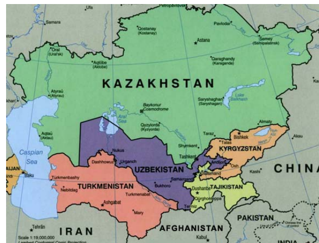
Russia and Central Asia

revolutions", the secretary general of the Collective Security Treaty Organization, General Nikolai Bordyuzha, said in a speech in Almaty on April 19, "Today, it is not only Afghanistan that the entire post-Soviet space is concerned about. There is a problem of the export of revolutions - the problem of attempts to intentionally bring about their elements. And we can see it. Today, there are recognizable people, exporters of revolution, the so-called contemporary revolutionaries - new Che Guevaras - in the post-Soviet space."