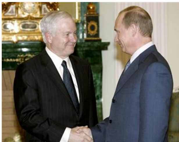
Gates and Putin in Moscow

Hardly had Yeltsin, archetypal symbol of post-Soviet Russia's "Westernism", departed than Gates, one of spymaster John le Carre's "Smiley's people", arrived on a mission to let the Kremlin know that no matter Russian sensitivities, Washington was going ahead with its deployment of missile-defense systems along Russia's borders. Gates reminded the Russians how little had changed since the collapse of the Soviet Union in 1991.