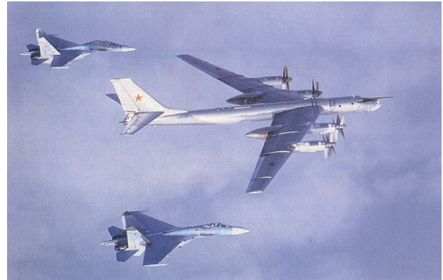
Russia's TU-95MS strategic bomber

about 1,500 ALCMs. Rogov argued that measures such as these will be cost-effective insofar as mass production of ICBMs and ALCMs will cost less than US$1 billion per year - a tiny fraction of the US expenditure in developing the missile-defense system.