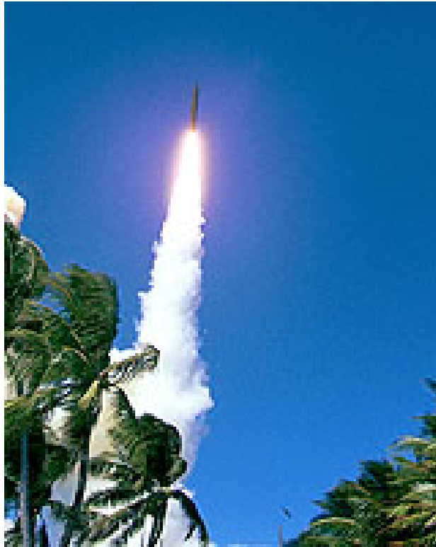
US Missile Interceptor

contemplating in Poland and the Czech Republic. It said that the US is planning to field 10 long-range ground-based missile interceptors in Poland and a mid-course radar in the Czech Republic to counter the growing threat of missile attacks from the Middle East.