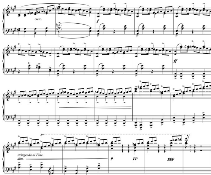
Example 3. Final bars of Backer-Grøndahl, Danse Norvégienne (Huldreslaat) (London and Leipzig: Lucas, Weber, Pitt, & Hatzfeld, 1893)

Grieg's augmented chords conjured in the minds of sighing female listeners (Figure 1). 140 While Shaw may have mocked such picturesque associations, this edition of Huldreslaat and its inclusion as an insert in the Strand Magazine in 1895 attest to the exotic appeal that such 'national' compositions held for many domestic amateur pianists. 141