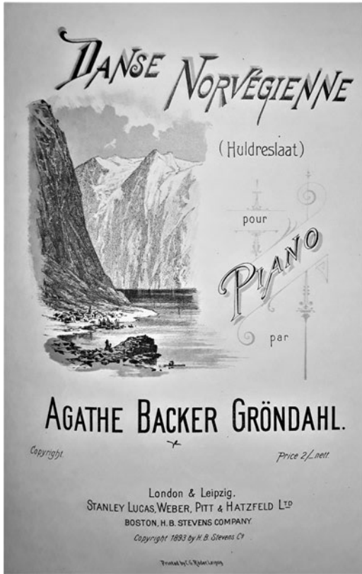
Figure 1. The cover of Backer-Grøndahl, Danse Norvégienne (Huldreslaat) (London and Leipzig: Lucas, Weber, Pitt, & Hatzfeld, 1893)

he ignored the tastes and interests of the audience while the pianist did not. 144 The paper argued that the pianist's largely female English audience were particularly fond of character pieces and she felt a duty to nurture their appreciation of works in this genre by her compatriot Grieg. Backer-Grøndahl's programme also featured music by Norwegian composers that were not overtly 'national' in character, such as her own concert études. However, the focus provided by evocative pieces such as Huldreslaat , Fanitull , and the 'Bridal Procession' ensured that critics perceived a distinctly 'national' flavour in the recital as a whole. The Daily News , for example, stated that the concert 'relied chiefly on Scandinavian music', while the Times claimed that 'the influence of Grieg was felt on nearly every piece'. 145