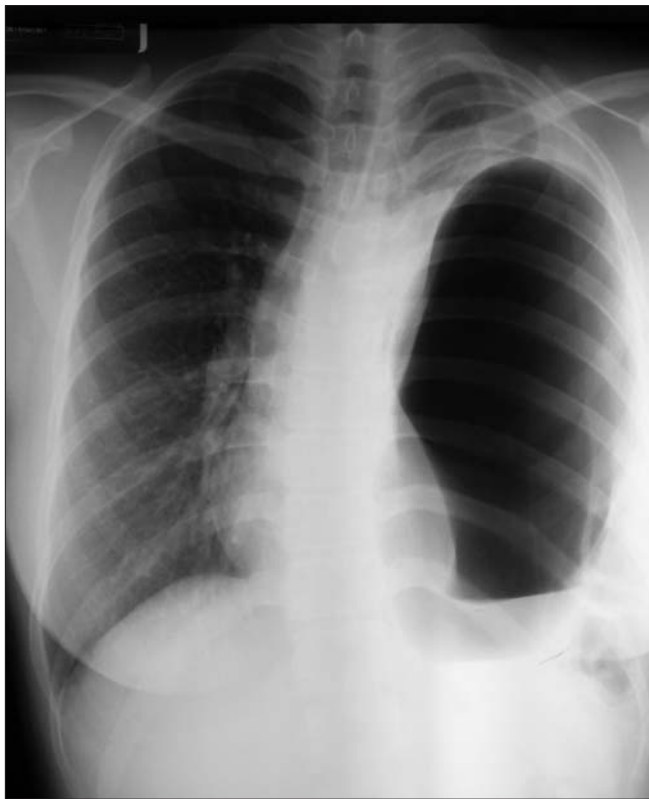
Fig. 1. First chest radiograph, results of which were interpreted as a loculated left pneumothorax.

On arrival, the patient was alert but dyspneic, with a respiratory rate of 33 breaths/min and an oxygen saturation of 95%. She was hemodynamically stable but febrile, with a temperature of 39°C. Auscultation revealed decreased air entry in the left chest and mild epigastric tenderness. The initial chest radiograph performed in the ED was interpreted as showing a loculated left pneumothorax (Fig. 1), and she was admitted to the respiratory unit. Fortunately, before tube thoracostomy, an astute respiratory physician inserted a nasogastric tube and repeated the