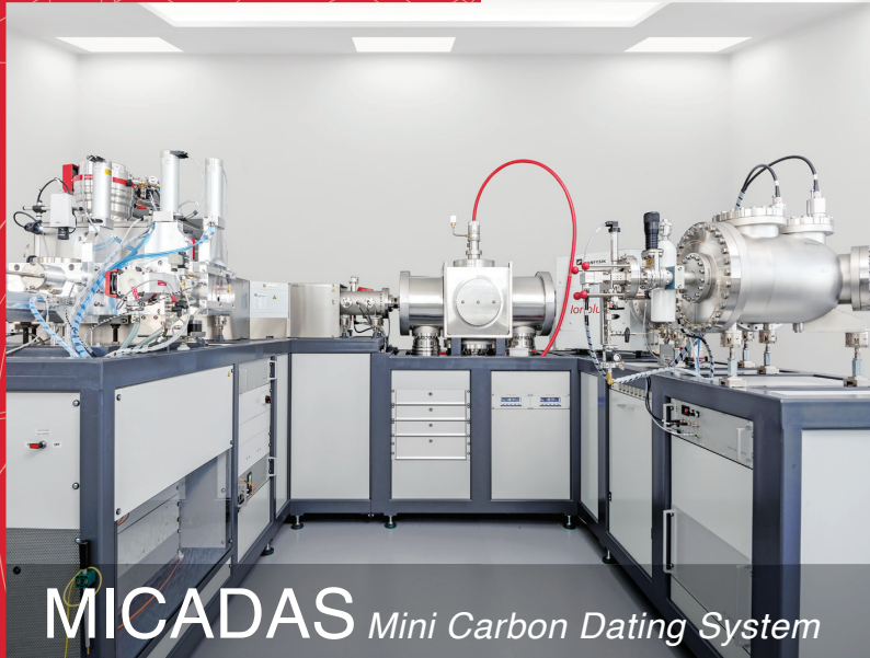
MICADAS Mini Carbon Dating System

Scientific Instruments for Radiocarbon Dating and Accelerator Mass Spectrometry