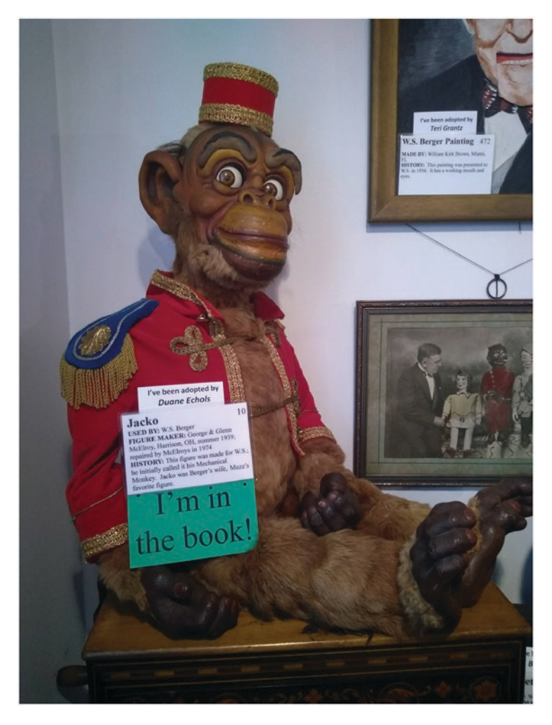
Figure 4. W.S. Berger's dummy Jacko is given a place of prominence at the Vent Haven Museum. While Jacko's minstrel history is not acknowledged by Vent Haven, he is here dressed in a bellhop costume (another stock feature of minstrelsy).

of violent intimacy she inherits from the minstrel show.