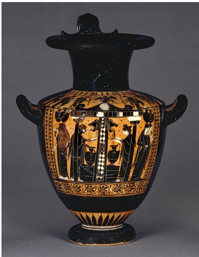
Fig. 2. Black figure hydria with women at the fountain house, ca. 520–500, Vulci. British Museum BM334.

That fetching water was gendered as women's work is also clear from the iconographic evidence, particularly scenes of women at the fountain house, popular on Athenian pottery in the late Archaic and early Classical periods. Men appear sometimes in these scenes (see below), but they are vastly outnumbered by women (see, for example, fig. 2). However, in concentrating on how these images construct idealized and idealizing notions of gender, scholars have missed the opportunity to consider how these discourses shaped lived experience. 100 Such readings deliberately set themselves apart from quotidian concerns; the depictions here are cultural constructs, not actual women whose bodies were transformed by