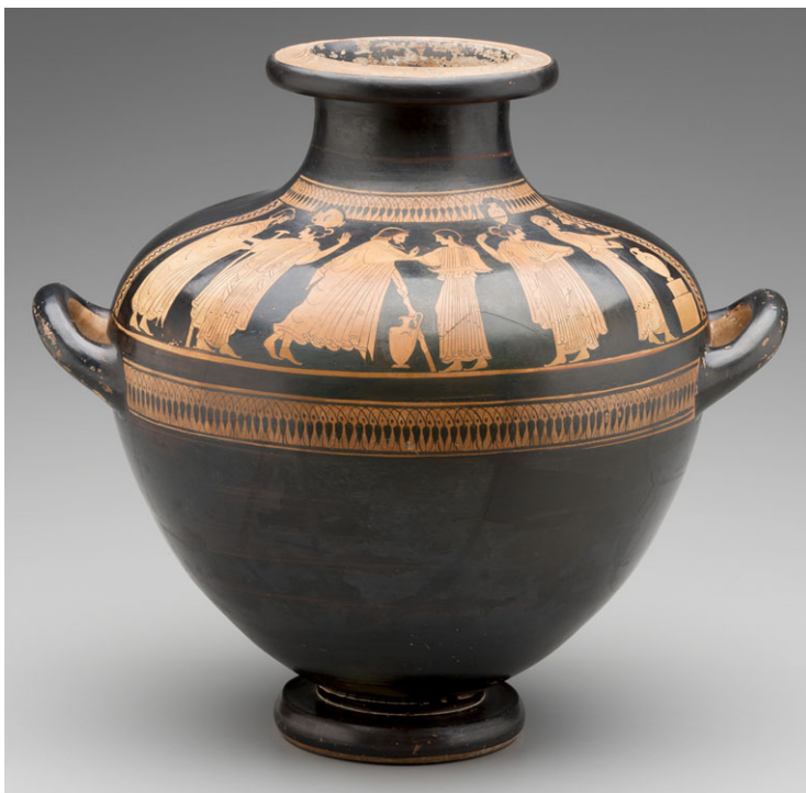
Fig. 4. Red Figure pelike attributed to the Pig Painter, ca. 475–450, depicting mantle-wearing men accosting women at fountain. Detroit Institute of Arts, Founders Society Purchase, General Membership Fund, 63.13.

seen as marginal. In fact, it overlapped with other activities: food preparation, cleaning, animal husbandry, the watering of plants, pottery manufacture, metallurgy, etc. No activity was possible for long without a supply of water.