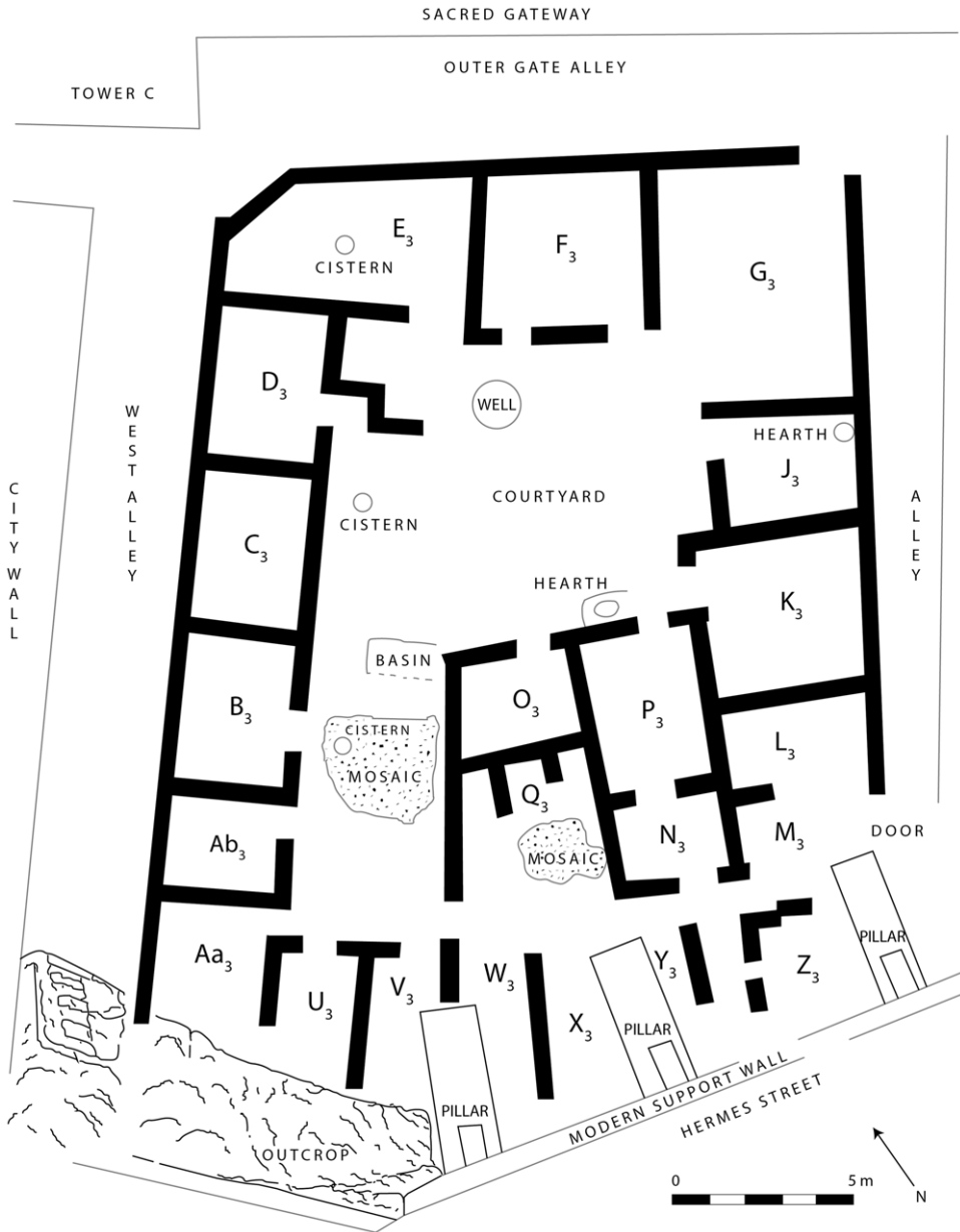
Fig. 1. Plan of Bau Z3, Kerameikos. Drawing by Thanasi Papapostolou based on Knigge (2005) supplement 5 and Ault (2016) fig. 4.4.

under her spell. The depiction of the activities that took place in the building, for example, Euktemon dining with Alke (6.21), its location near the postern gate (6.20) and the mention of oikēmata where Alke allegedly worked, albeit not here but in a building Euktemon had previously owned in the Piraeus (6.19), were linked to the archaeological finds of Bau Z and used as a template for interpreting them. The small personal items of jewellery and religious figurines were seen therefore as the property of foreign slaves (the paidiskai of Euktemon's Piraeus sunoikia , 6.19), the coins were evidence for the selling of sex and the