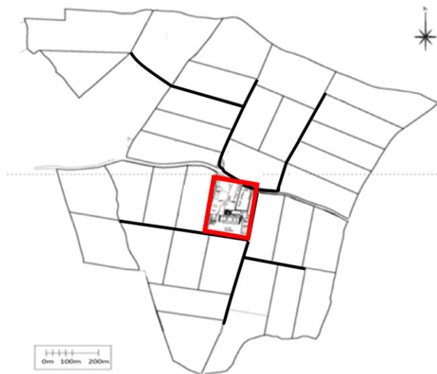
Figure 1. A layout of a pasture based dairy farm. An integrated farm roadway network and the farmyard location within the grazing platform. Red box: farmyard location. Figure sourced from Maher et al. (2023a).

access areas of pasture from farm roadways while reducing treading damage to the paddock. This involves the creation of narrow roadways (1–2 m wide) to allow the herd to access the furthest points of grazing paddocks without causing damage to areas already grazed. It has also been recommended that the furthest point from a roadway to the back of a paddock is no more than 250 m on dry land and 50–100 m on heavier soil types (Teagasc, 2021). Adding additional entry/exit points to paddocks reduces treading damage of a single entry/exit point which deteriorates the quality of the surface. This has been associated with increased lameness on pasture-based farms (Browne et al. , 2022a).