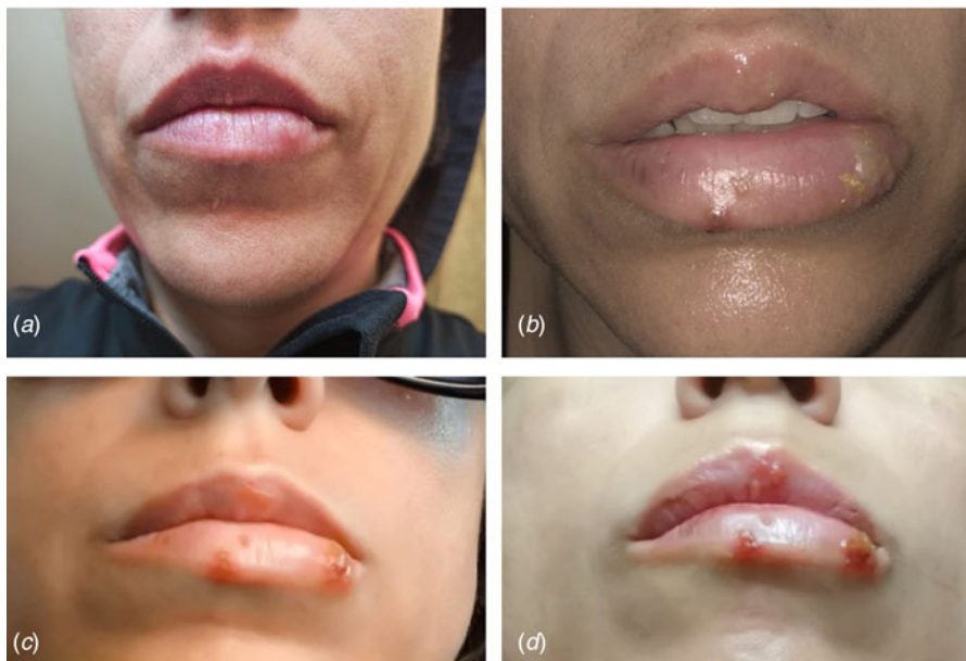
Fig. 2. Case 2. (A) Prodromal period with burning area and itching on the lower lip; (B and C) florid period of infection with increased number of vesicles on the lips and (D) referral period. Negative RT-PCR for SARS-CoV-2.

and decreased cardiac output with multi-organ damage [15, 17]. This altered immune response facilitates the replication of the virus and the increase in the viral load, by means of causing the NK cells and CD8 + lymph T cells to become exhausted and hence the coronavirus cannot be eliminated [18]. In the same way as occurs in other states of hyperactivation of the immune system, such as burn patients, polytraumatised patients and head trauma patients, the increase in adhesion molecules could generate a state of immunodeficiency of T and B lymphocytes which would remain attached to the endothelium of the blood vessels and therefore unable to enter the site where they should perform their function [19, 20]. In addition, the SARS-CoV-2 infection produces a reduction in the percentages of monocytes, eosinophils and basophils [2].