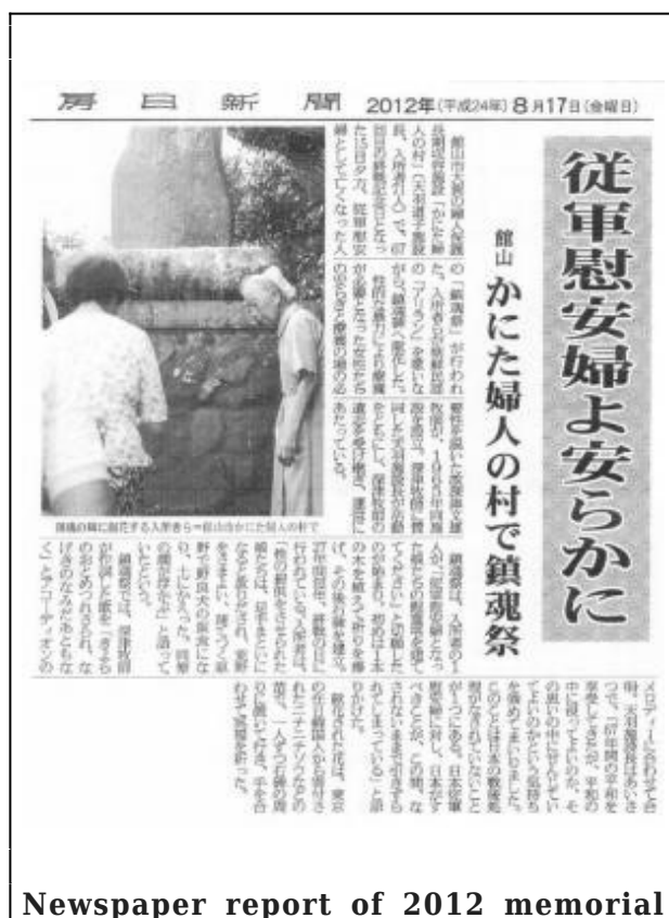
Newspaper report of 2012 memorial

The end of the war did not spell the end of the Japanese government's 'comfort women' policy. After the war, it deployed the same policy for the sake of occupying forces in Japan. It feared suffering the same fate as had been inflicted by Japanese troops against colonised and invaded populations in the war who suffered rape and pillage. Via a directive issued by the head of the security agency in the Home Affairs Ministry, sex industry entrepreneurs operating around domestic military bases in Japan were required to establish comfort stations. Thereby commenced the 'Recreation and Amusement Association' (RAA) system of prostitution, which, in spite of common misunderstanding,