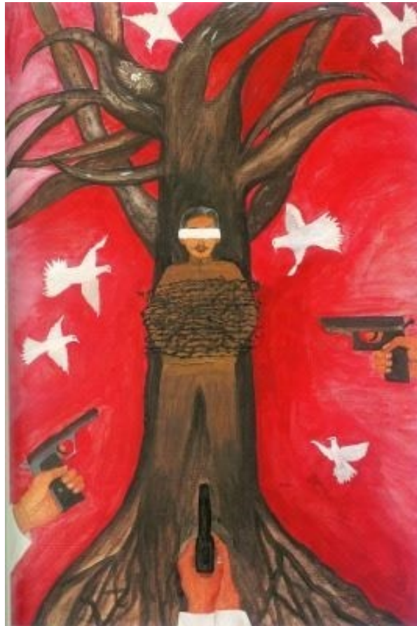
Painting by a South Korean comfort station survivor submitted as part of an application for the UNESCO Memory of the World Register. The picture envisages the execution of the Showa emperor.

border trafficking into comfort stations. After all, it is very difficult to differentiate among those who are in prostitution abroad on the basis of free will, and those on the basis of fraud.