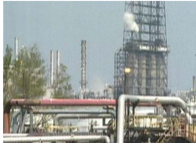
China-Iran Oil Deal