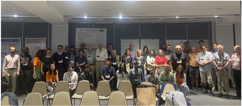
Figure 1. A group of participants after the closing ceremony.