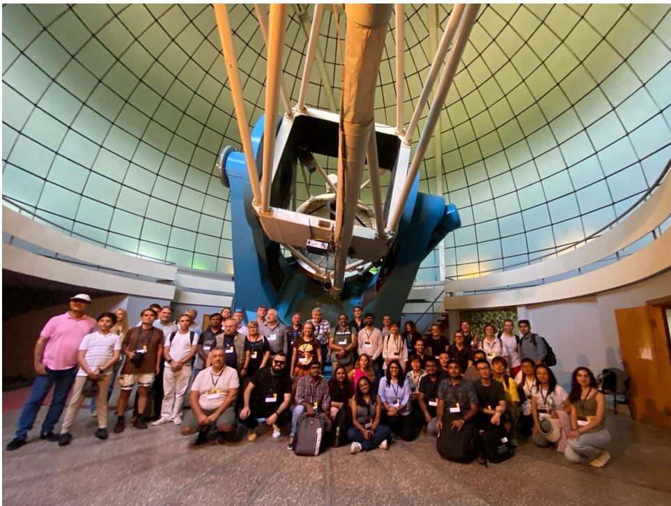
Figure 2. A group of participants visiting the Byurakan Astrophysical Observatory, in the tower of the 2.6-m telescope.