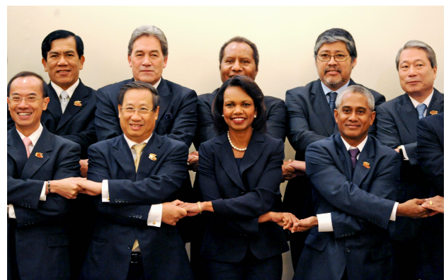
ASEAN Regional Forum leaders meet in 2008

While there is great scepticism about the capacity of both the ASEAN, and the security organisation it spawned – the ASEAN Regional Forum (ARF) – to manage effectively a number of pressing issues, [46] a focus on substantive 'outcomes' may miss more subtle processes of socialisation and identification that are steadily transforming perceptions within, and of, the region. Although ASEAN may have originally emerged as a defensive response to the actions of extra-regional powers during the Cold War, its very endurance has given political expression and an increasing sense of identity to what was hitherto a rather arbitrary geographical space. It is also worth noting that there has been no direct conflict between ASEAN members since its inception – an achievement for which ASEAN can take some credit. [47]