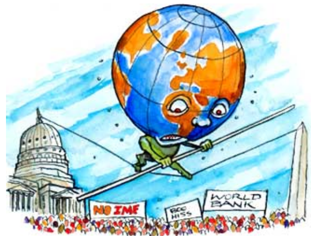
The Washington Consensus

organisations—especially if China's economic development continues to cement its place at the centre of an increasingly integrated regional economy. I suggest that the US's hegemonic influence over East Asia is consequently likely to decline and so is the significance of the 'Asia-Pacific' region of which it is notionally a central part.