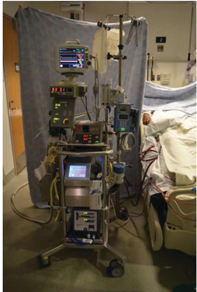
Figure 1. Venoarterial extracorporeal membrane oxygenation machine in use for an intensive care unit patient.

The broad term ECMO is commonly used to describe both the venovenous (VV) and VA versions of ECMO. VV ECMO is indicated when only the pulmonary system requires support, such as in severe acute respiratory distress syndrome, and requires venous cannulation with a dual lumen catheter or two single-lumen catheters. 5 VA ECMO requires the placement of both venous and arterial catheters and is indicated when both the cardiovascular and pulmonary