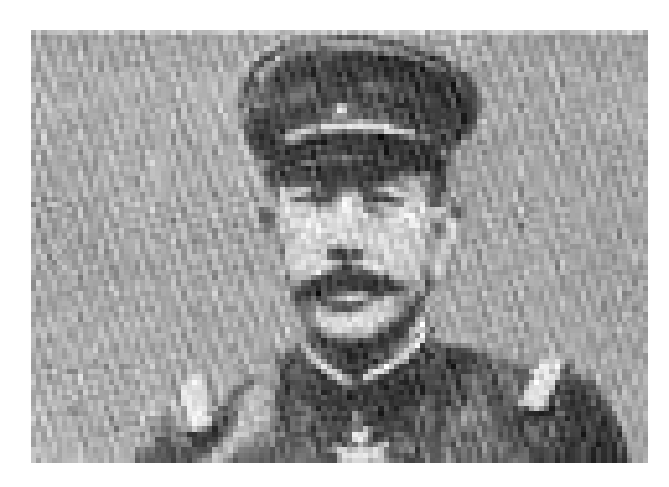
Lt. General Ishii Shiro

The network itself was based at the Epidemic Prevention Research Laboratory, established in 1932 at the Japanese Army Military Medical School in Tokyo. Unit 731 was the first of several secret, detached units created as extensions of the research lab; the units served as field laboratories and test sites for developing biological weapons, culminating in the experimental use of biological weapons on Chinese cities. The trial use of these weapons on urban populations was a direct violation of the 1925 Geneva Protocol, which outlawed the use of biological and chemical weapons in war. It was also understood by those involved that the use of human subjects in laboratory and test site experiments was inhumane. This was why it was deemed necessary to establish Unit 731 and the other secret units.