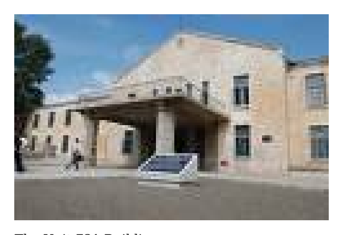
The Unit 731 Building Reconstructed as a Museum at Pingfan

With the construction of the Pingfan facilities, the primary research staff changed in composition from the military doctors of the Togo Unit to private-sector medical researchers affiliated with universities and other institutions. The first group to be posted to the unit was a team of eight assistant professors and instructors from Kyoto Imperial University in the spring of 1938. The group consisted of two bacteriologists, three pathologists, two physiologists, and one researcher specializing in experiments using animals. Within a year, a second group had arrived at the facility, and the research staff had expanded considerably. The prominence of researchers in pathology and physiology in the development of biological weapons reflected the need for specialized judgment in assessing the results of human experimentation.