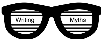
Figure i.1 Myths glasses

say every student should have a chance, but we only give correct writers credit and opportunity. Or the fact that tests call only the right side of the continuum “clear,” as though informal writing cannot be understood. Through the myth glasses, we get used to these contradictions. We don’t know how to see writing, or talk about it, any other way.