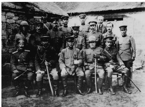
Zumoto (back row, first from the right) with foreign military observers and Lieutenant General Mitsuomi Kamio (first row center?) in Tsingtao in 1915 84 .

It is also apparent from photographic evidence that Zumoto accompanied the Japanese and British allied forces in the 1914 siege of Tsingtao.