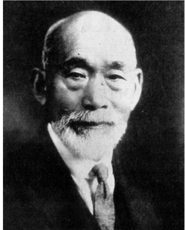
Zumoto Motosada, founder of The Japan Times 1

Keywords: Meiji-era Japanese propaganda, The Japan Times, Zumoto Motosada, Japanese Imperialism, Anglo-Japanese rapprochement, colonisation of Korea.