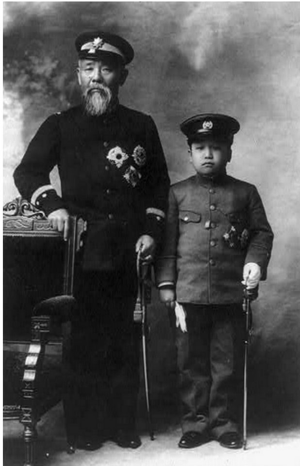
Itō Hirobumi as first Resident-General of Korea with the Crown Prince of Korea Yi Un 70

Times after Zumoto's resignation, Russell Kennedy (further evidence to demonstrate The Japan Times ' status as a semi-official Government organ) as well as Zumoto Motosada 67 who had travelled to Korea in early 1906. In January 1906, Zumoto organised the acquisition of The Seoul Press from Hodge by the office of the Korea Resident General 68 and the paper was expanded from a weekly to a daily newspaper 69 . The Seoul Press , thus, became the official English-language propaganda organ of the Residency-General.