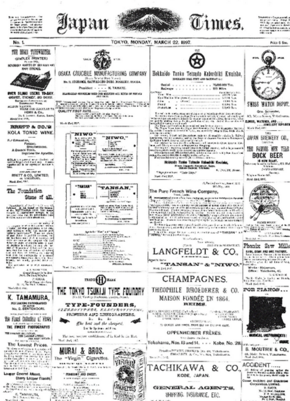
The front cover of the inaugural issue of The Japan Times , 22nd March 1897 53