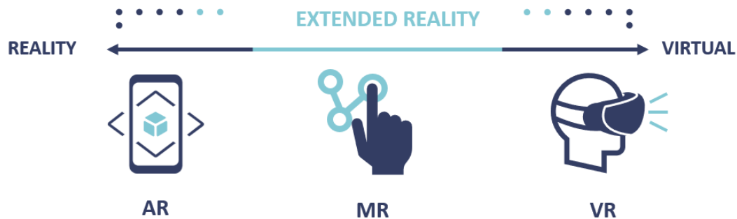
Figure 1. The genesis of extended reality

world for an augmented live view, but the interaction with reality is rather limited (Arth et al., 2015). On the other hand, MR integrates the features of both techniques, in a way that ‘ real world and virtual world objects are presented together within a single display ’ (Milgram and Kishino, 1994, p.3), while users can interact with both real and virtual elements (Figure 1). Supported by the revolutionary technological progress, XR techniques are pushing the boundaries of human-tech interaction nowadays (Jain and Werth, 2019; Kwintiana and Roller, 2019)