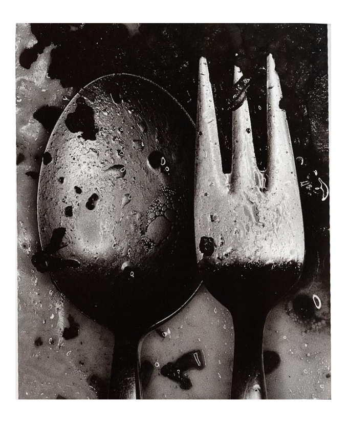
From the collection at the Barbican in London

He has photographed other places, and even men, but it is Tokyo's women he keeps coming back to, ever since picking up a camera in the sixties. "For me, taking photos is essentially an act of love," he says. "I know when I look into the viewfinder and can't sense the sexiness that it is going to be a bad photograph." All creativity, he believes, comes from the sexual urge; he often compares the timing of depressing the shutter to sex. "I don't take photographs with my head. I take them with my dick."