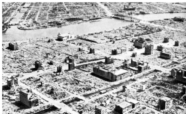
Aerial photo of Tokyo after the bombing of March 9-10.

The chief characteristic of the conflagration . . . was the presence of a fire front, an extended wall of fire moving to leeward, preceded by a mass of pre-heated, turbid, burning vapors . . . . The 28-mile-per-hour wind, measured a mile from the fire, increased to an estimated 55 miles at the perimeter, and probably more within. An extended fire swept over 15 square miles in 6 hours . . . . The area of the fire was nearly 100 percent burned; no structure or its contents escaped damage.