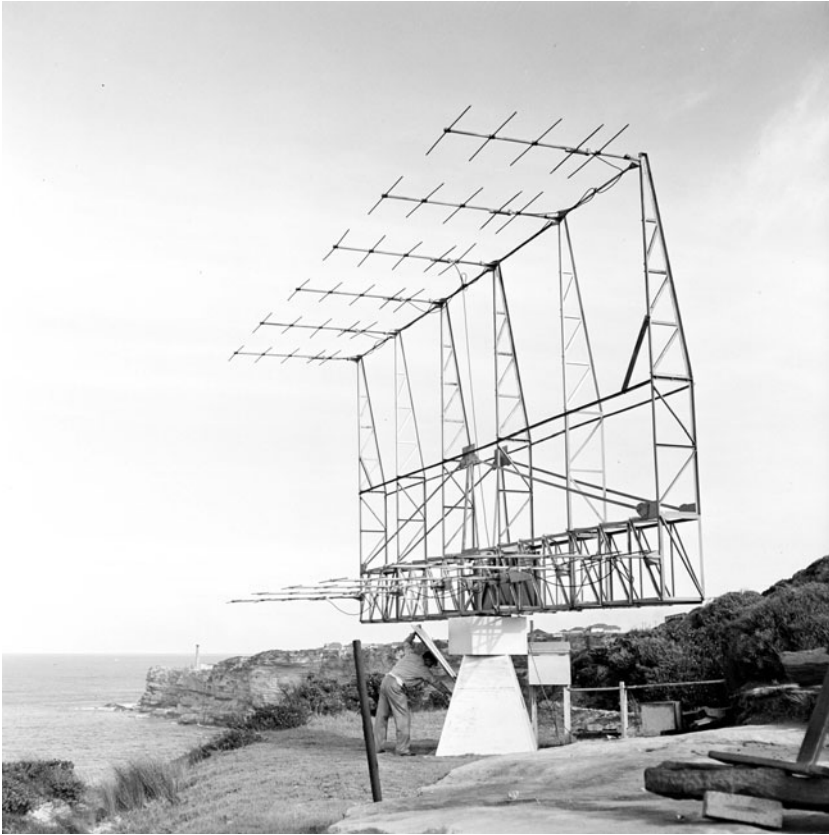
Figure 2. A 12-element Yagi antenna installed on the cliff top at Dover Heights and mounted on the turntable of a WWII radar. The antenna had a 12 degree beam and was used in 1951–1953, at a frequency of 100 MHz, to carry out a survey for discrete radio sources. One hundred and four sources were detected in this survey. In 2003, a full sized-replica of one of the early Yagi antennas was installed on the cliff top at Dover Heights as a memorial to the site.

The postwar successes established radio astronomy as a rapidly growing area of astronomy research. Sullivan (2009a) has noted that the first known usage of the term ‘radio astronomy’ in the West, occurs in a letter by Joseph Pawsey written in January 1948. In August 1948 the new Commission for ‘Radio Astronomy’ was established by the IAU. Within a year the term radio astronomy was in common use.