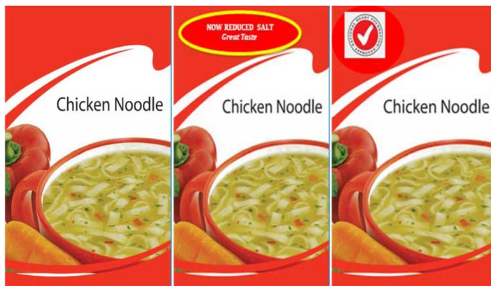
Fig. 2 (colour online) Packages (left, no health label; middle, reduced-salt label; right, tick label) that were shown to the participants prior to and during the tasting of the soups

the right amount of salt for me' and 9 = 'far too salty for me'. Expected and perceived liking were measured with a 9-point hedonic scale ranging from 1 = 'not liked at all' to 9 = 'extremely liked'. All sensory data were collected using CompuSense software version 5 (Compusense Inc., Guelph, ON, Canada).