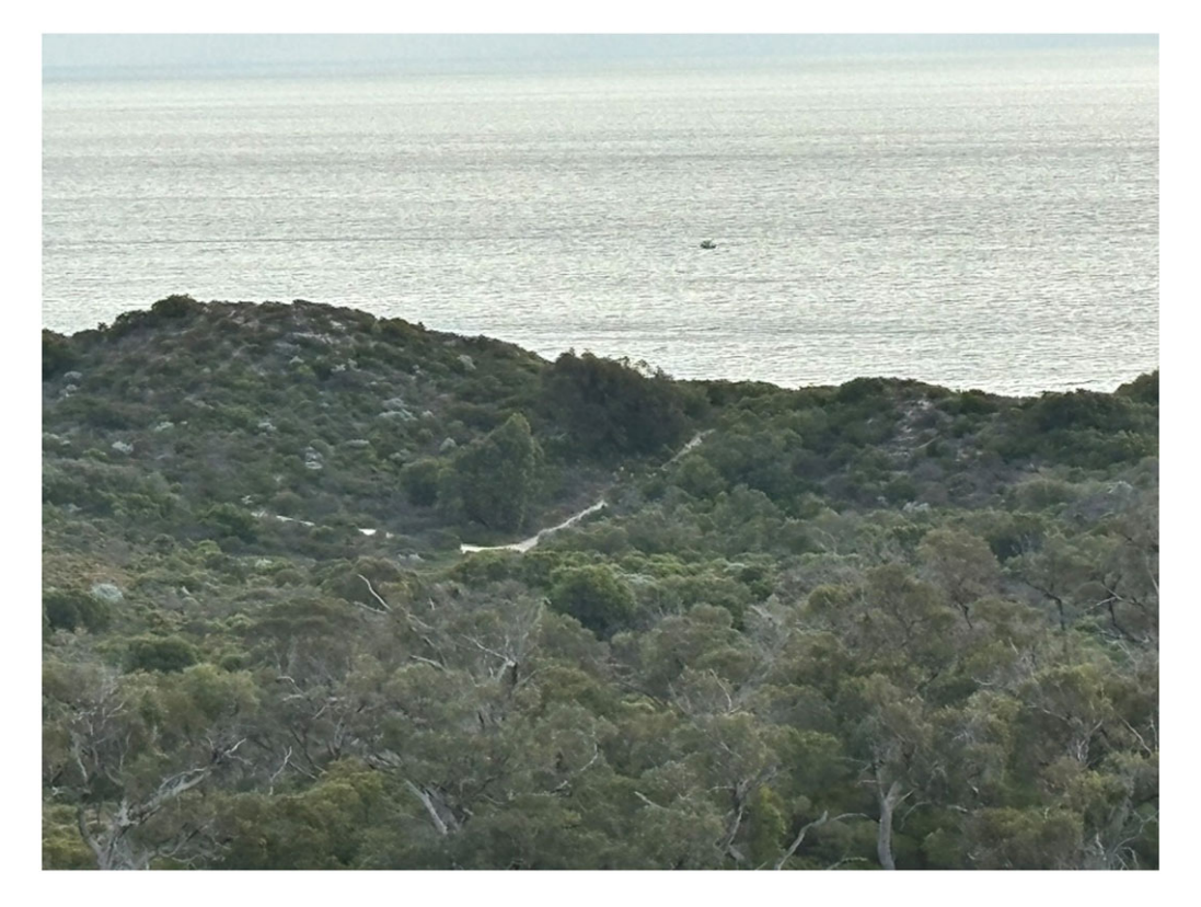
Figure 4. Kaartdijin Bidi: Walking with Country - human, plant, wind and current.

properly, the right way. For us that means following Rom, Yolnu Law. It also means honouring the sovereignties of Yolnu people and Country, and their concomitant knowledge protocols. (Bawaka Country et al., 2023, p. 282)