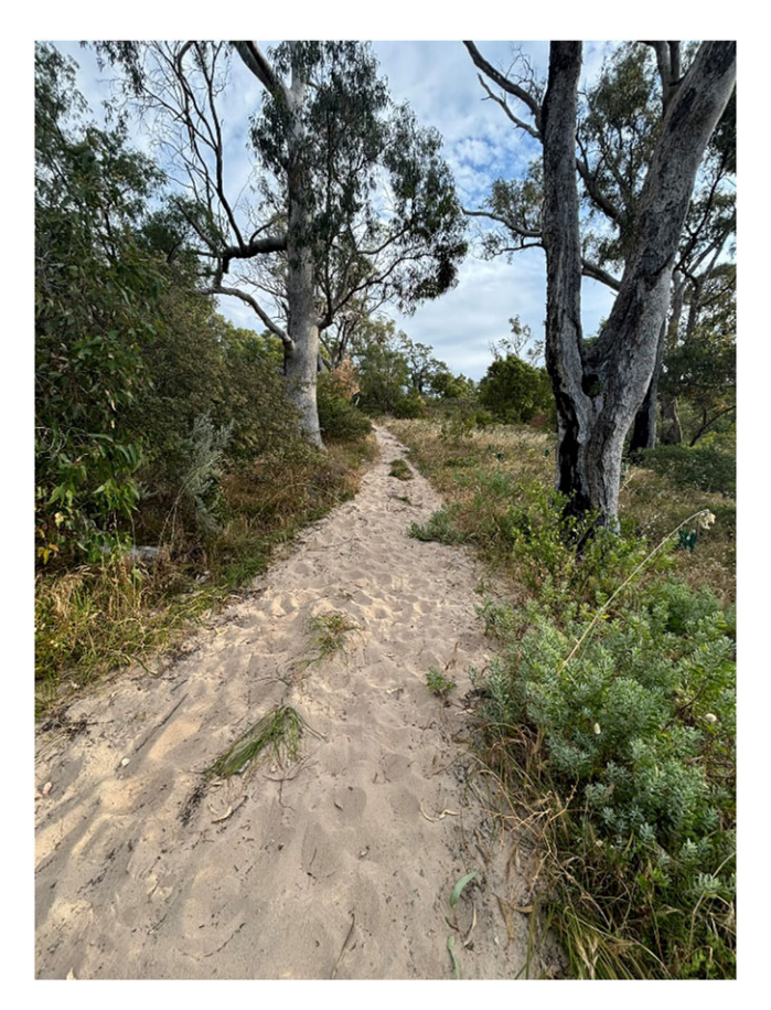
Figure 3. Here, kaartdjjin bidi as metaphor is sandy, uphill and generally hard work when dealing with power.