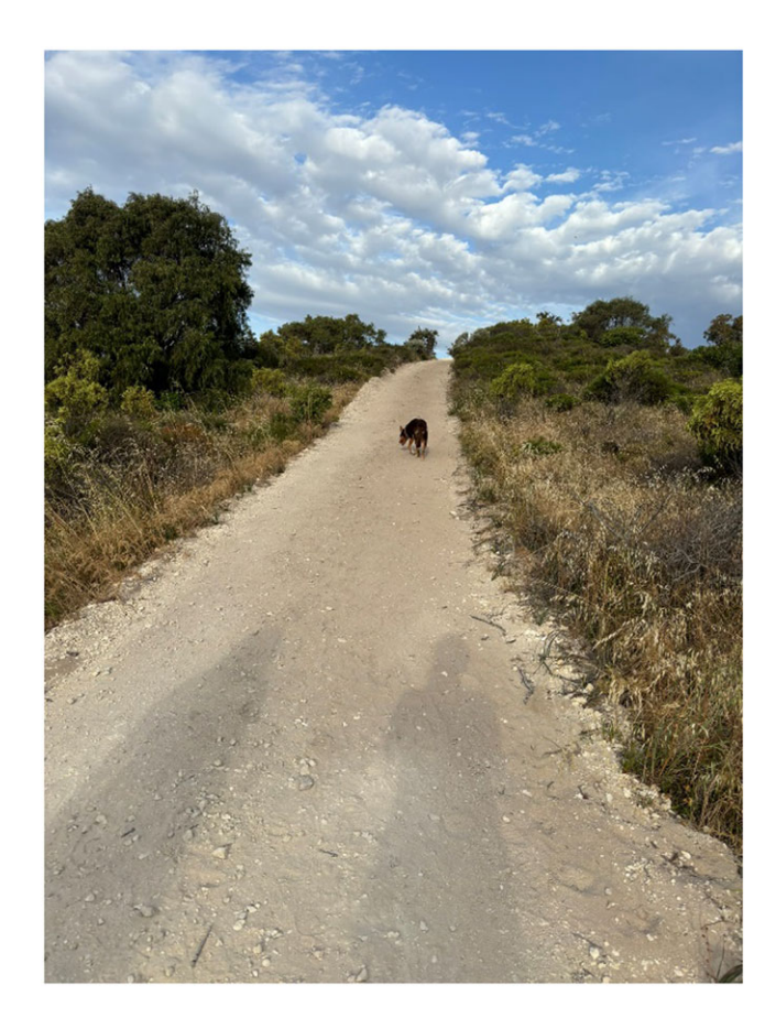
Figure 1. Kaartdijin bidi – Knowledge Pathway, learning journey. This pathway is in Kalgalup Regional Park, Wardandi Boodja (Bunbury region).

Noongar knowledge pathway — to creatively navigate a way into and beyond the corporate university, using place-based (in this case, Noongar) knowledge systems (See Figure 1). The significance of kaartdijin bidi in this paper is fourfold. First, it is about knowledge acquisition and learning. Second, it is that boordiya (leaders, persons who know bidi , the tracks) are responsible for maintaining, burning, healing and caring for Country — including its stories, more-than-human kin, ceremonies, arts, music, and spirits or wirrin . (Poelina et al., 2020). In other words, Noongar boordiya have significant cultural wisdom that offers a local, place-based standpoint on longstanding problems that may be entrenched in colonial ways of thinking. Third, Kaartdijin bidi is visual, metaphoric, poetic and locally practical. Fourth, it is about the experience of moving on Country, especially walking. To walk with Country is to experience and get to know Country, to develop a learning relationship of reciprocal care.