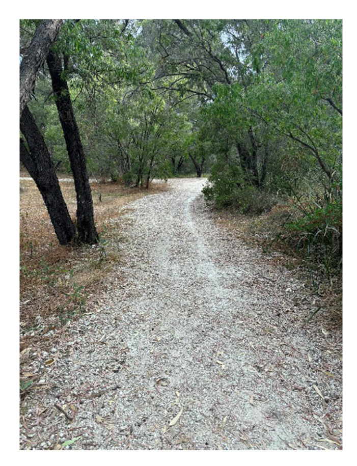
Figure 2. Kaartdijin bidi is easy to navigate at the start.

forest where the Collie River flows. There are tracks through the forest to a significant pool in the river where, once upon a time before now, Ngangungudditj walgu, the sacred hairy face snake, dropped off its people (Northover, 2008). The edge of a town or village makes it very easy to communicate with the beings of the more-than-human world (Abram, 1996).