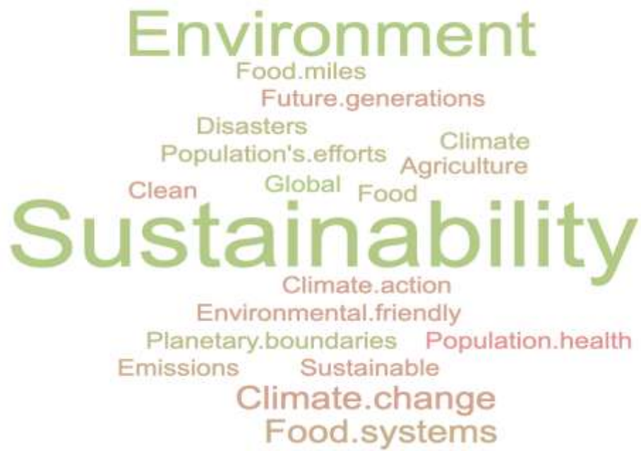
Figure 1: Word Cloud of responses to “What words come to mind when you think about 'Planetary Health'?”