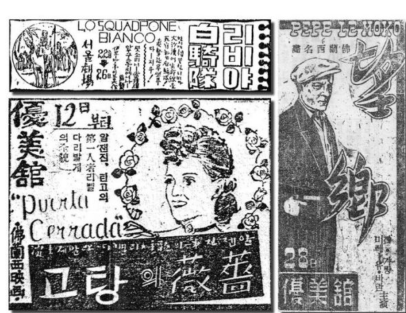
Figure 2. Advertisements. top: 'The White Squadron', New Corea Times 21 December 1945, p. 2; bottom: 'Puerta Cerrada', Hansung Daily 14 December 1946, p. 2; side: 'Pépé le Moko', Hansung Daily 27 October 1946, p. 3.

Leftist entrepreneurs also stepped in to fill the gap in control of the film scene. Before USAMGIK had begun in earnest to assist the US film industry to spread 'American' views of so-called democracy and modernity via the exhibition of Hollywood films, other organizations such as the left-wing Chosun Film Federation (hereafter CFU) began holding screenings of Soviet feature films. In the early post-war period, CFU had stimulated debate in southern Korea about Korea's political and social future by screenings of films, such as Sergei Eisenstein's Ivan the Terrible (1944), as well as Soviet newsreels (Armstrong 2003). They too were interested in developing new cultural ideas and attitudes that could help Korea move away from the militaristic ideology of the former Japanese colonial government. 24 Yet, their activities were strongly opposed by the USAMGIK authorities – particularly given the proximity of Soviet forces in the northern part of Korea. 25