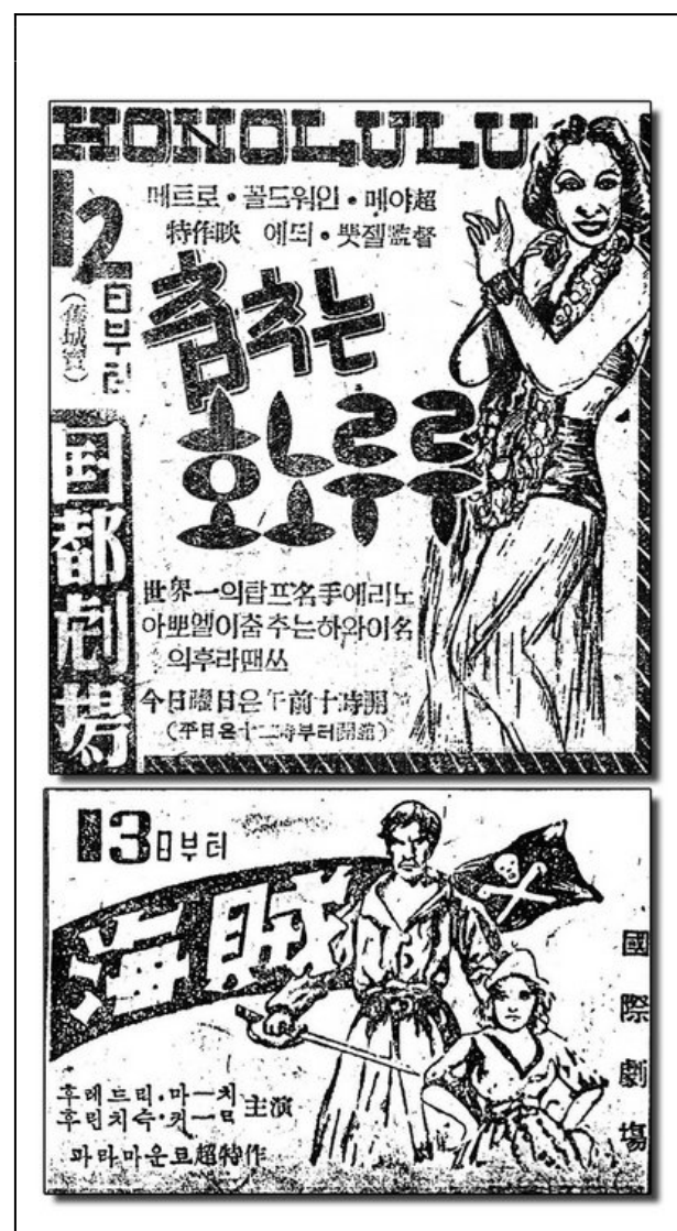
Figure 3. Advertisement. Top: 'Honolulu', Hansung Daily 14 July 1946, p. 4; bottom: 'The Buccaneer', The Korean Free Press , 13 May 1946, p. 2.

Buccaneer (1938), The Rains Came (1939), Golden Boy (1939), Honolulu (1939), The Under Pup (1939) and Abe Lincoln in Illinois (1940). These were 'prestige pictures' in the sense that they were 'injected with plenty of star power, glamorous and elegant trappings, and elaborate special effects' (Balio 1995, p. 180) – attractive packaging for presenting some of the core democratic reform values that the US government wanted for Korea. 31