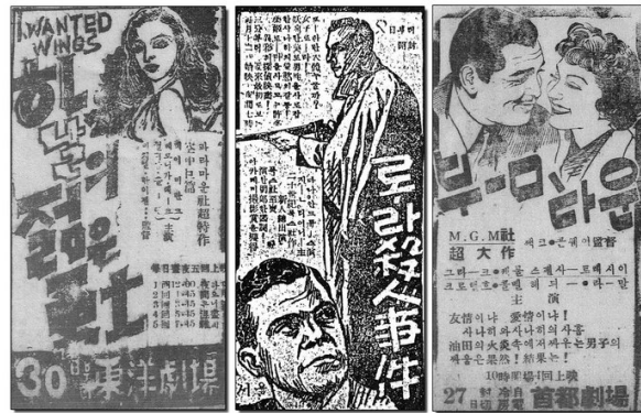
Figure 4. Advertisements. left: 'I Wanted Wings' (1941), Jayu Shinmoon 4 May 1948, p. 2; middle: 'Laura' (1944), Daidong News 8 June 1948, p. 2. right: 'Boom Town' (1940), Jayu Shinmoon 27 August 1948, p. 2.

Based on advertisements in Korean that appeared regularly in major local newspapers, a majority of the films screened at this time were talkies produced between the mid-1930s and early 1940s. Action-adventure and historical bio-pics were prevalent, followed by melodramas, screwball comedies, musicals, westerns, crime/detective thrillers, science-fiction and animated cartoons. 32 These advertisements attempted to lure audiences with arousing drawings and silhouettes of film stars, action scenes and exotic locations, promoting all the glamour of American culture. They depicted dashing portraits of leading Hollywood stars including Robert Montgomery, Judy Garland, Bing Crosby, George Raft, Eleanor Powell, Richard Dix, Clark Gable (about to kiss Claudette Colbert in Figure 4 below) and Jean Arthur as a feisty cowgirl in Arizona (1940).