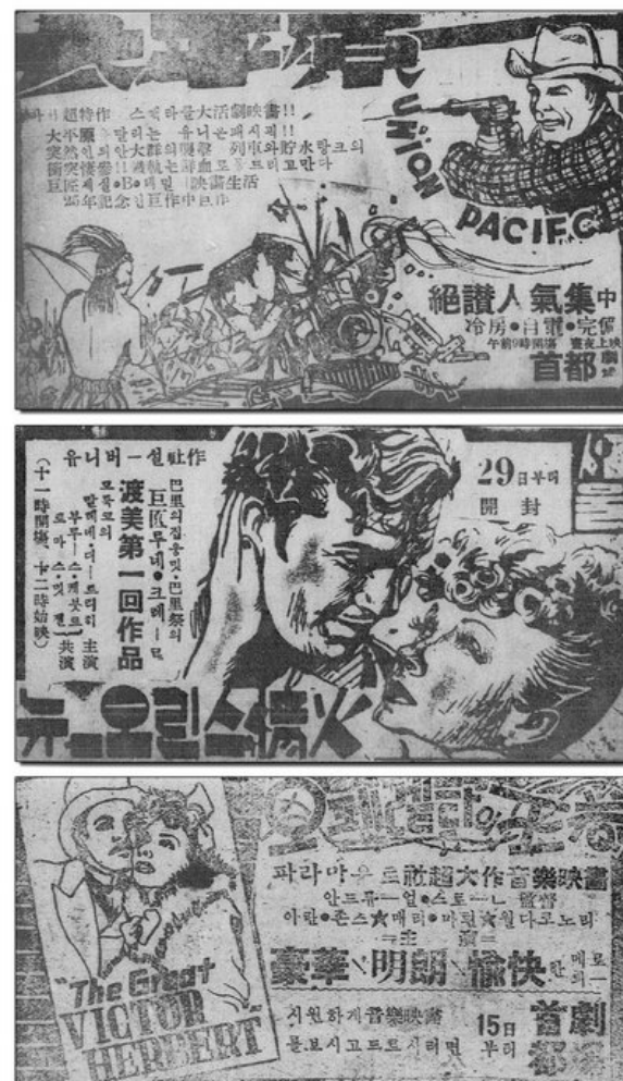
Figure 5. Advertisements. top: 'Union Pacific' (1939), Jayu Shinmoon 5 July 1948, p. 3; middle: 'The Flame of New Orleans', Jayu Shinmoon 5 July 1948, p.

exploration and desire for material wealth, as well as jealousy and rivalry over women, and social mobility. These are all themes that would have appeared in striking contrast to the colonial ideology of the Japanese occupation, let alone the pre-colonial values to which Korean audiences were accustomed. At the same time, the graphic imagery of the advertisements attracted non-Korean-speaking US troops as well - a welcome secondary audience.