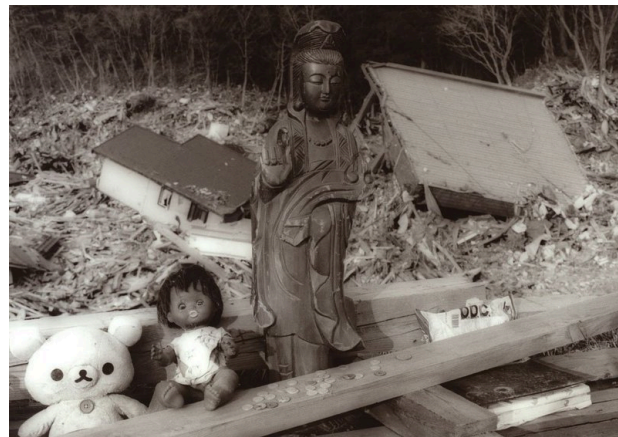
Fallen Kannon statue. Photograph by Jake Price Nagasaki temple destroyed, Wikipedia Commons