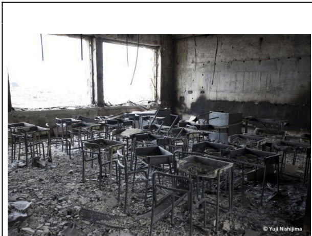
Minamihama School.

experienced by the community, which did not just encompass material loss, but also the loss of innocence and the future. This is shown in these images of a primary school which had been not only affected by the earthquake and tsunami but which had also then been gutted by fire. A set of photographs by Nishijima Yūji demonstrates this. While his photographs frame the destruction from a child's point of view, his commentary on the photograph makes intertextual references to other disasters.