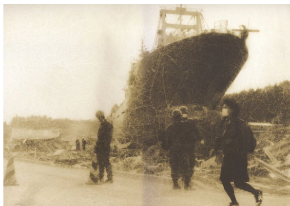
Tōhoku ship

Many of the 120 photographs rely on stylistic patterns – black and white, or over-exposed photographs. This photograph of survivors walking by a large ship washed ashore is developed in monochrome with a deliberate over-exposure to evoke a historical sense.