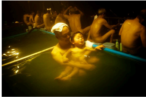
Evacuees at a Kesennuma shelter .

loving interaction between a parent and child despite unthinkable circumstances.