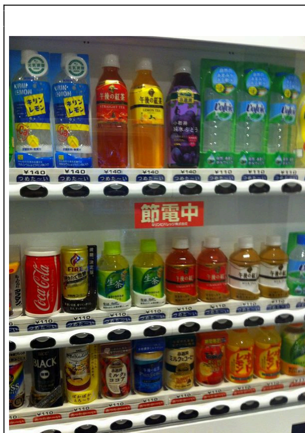
An Automated Drink Dispenser, Tokyo, stating ' Setsudenchū (currently saving electricity); Kirin Beverage Corporation'.

disaster, it illustrates a social response to the disaster, and an eloquent example of action based on empathy in the post 3/11 context. The drink dispenser carries a sign " setsudenchū " (currently saving electricity).