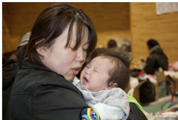
Crying Baby, photograph by Hiroshi Sato.

As mentioned above, photographs of children and children's objects were numerous in the exhibition, and they were represented in a number of ways. The exhibition featured pictures of children's toys in the rubble, as well as many photographs of children playing in and around the evacuation sites. While the destroyed schools and scattered toys could be seen as a sorrowful representation, the latter representation of child survivors at play suggested hope for the future. There were many photographs of adults holding babies, projecting a resilient image to a grieving public. The familiar scene of a mother comforting her crying infant symbolised the hope that the community, and its sympathising nation, could be comforted as well.