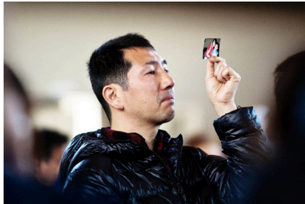
Survivor searching for his family in a Minamisanriku evacuation centre.

I have a 5"x7" reproduction of this photograph, of better quality and finer resolution than the digital reproductions here. In the print, the details are sharper, such as the trails of tears down the father's face as he holds up a photograph of his wife and child between two fingers, and the familiar shiny creases of his quilted down jacket, a ubiquitous piece of clothing in the Japanese winter. The sharp focus of the father against the blurred background of the evacuation centre accentuates the isolation he must have felt in his loss. The viewer is drawn into his pain wordlessly and completely, for any father from any town or city in Japan could imagine the same light feel of a UNIQLO jacket on his arm as he raised the photograph of his family in an evacuation center.