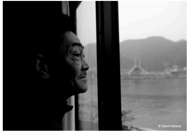
Elderly Survivor.

friends. The concentration of representations of elderly residents in the exhibition is not surprising as a disproportionate number of Northeastern Japan's population is elderly. Approximately one third of the affected residents were over 65, which is higher than the national average of 23%. 18