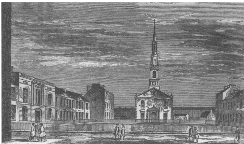
Figure 1: View of St Enoch's Square, with Surgeon's Hall (first building on the left) and church, in 1782.